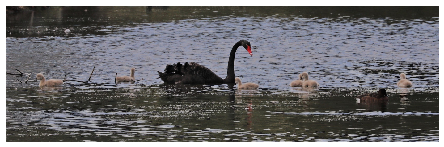
Black Swan with six cygnets on the Large Freshwater Lake today