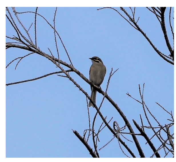
The first Yellow-faced Honeyeater to be recorded in Westgate Park