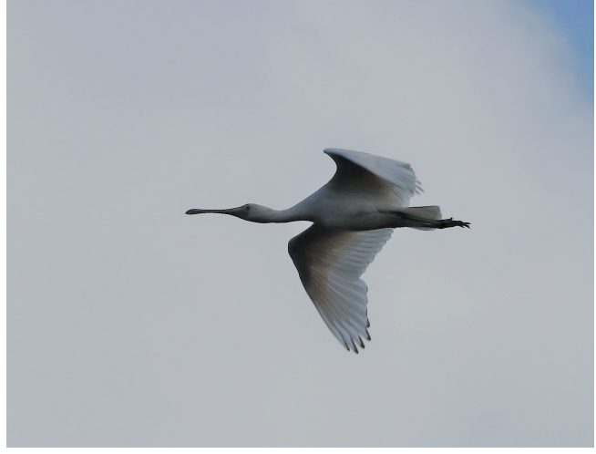
Australian White Ibis and Yellow-billed Spoonbill were seen together as a pair around the Large Freshwater Lake before flying out of the park later in the morning