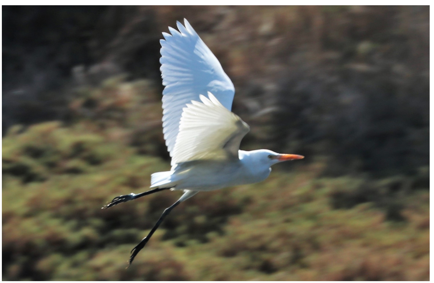
A lone Cattle Egret with a damaged or broken right leg was staying close to an Eastern Great Egret on the Large Freshwater Lake