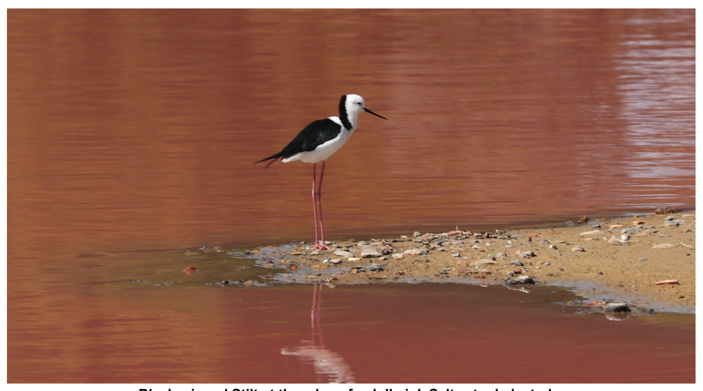
Black-winged Stilt at the edge of a dull pink Saltwater Lake today