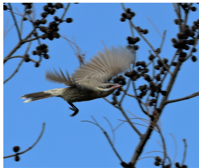
Spiny-cheeked Honeyeaters chasing insects in flight. The insects they are seeking are just visible in the image on the left