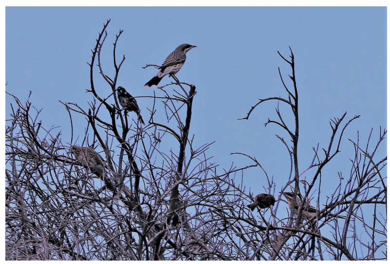
Three of the thirteen Spiny-cheeked Honeyeaters counted today