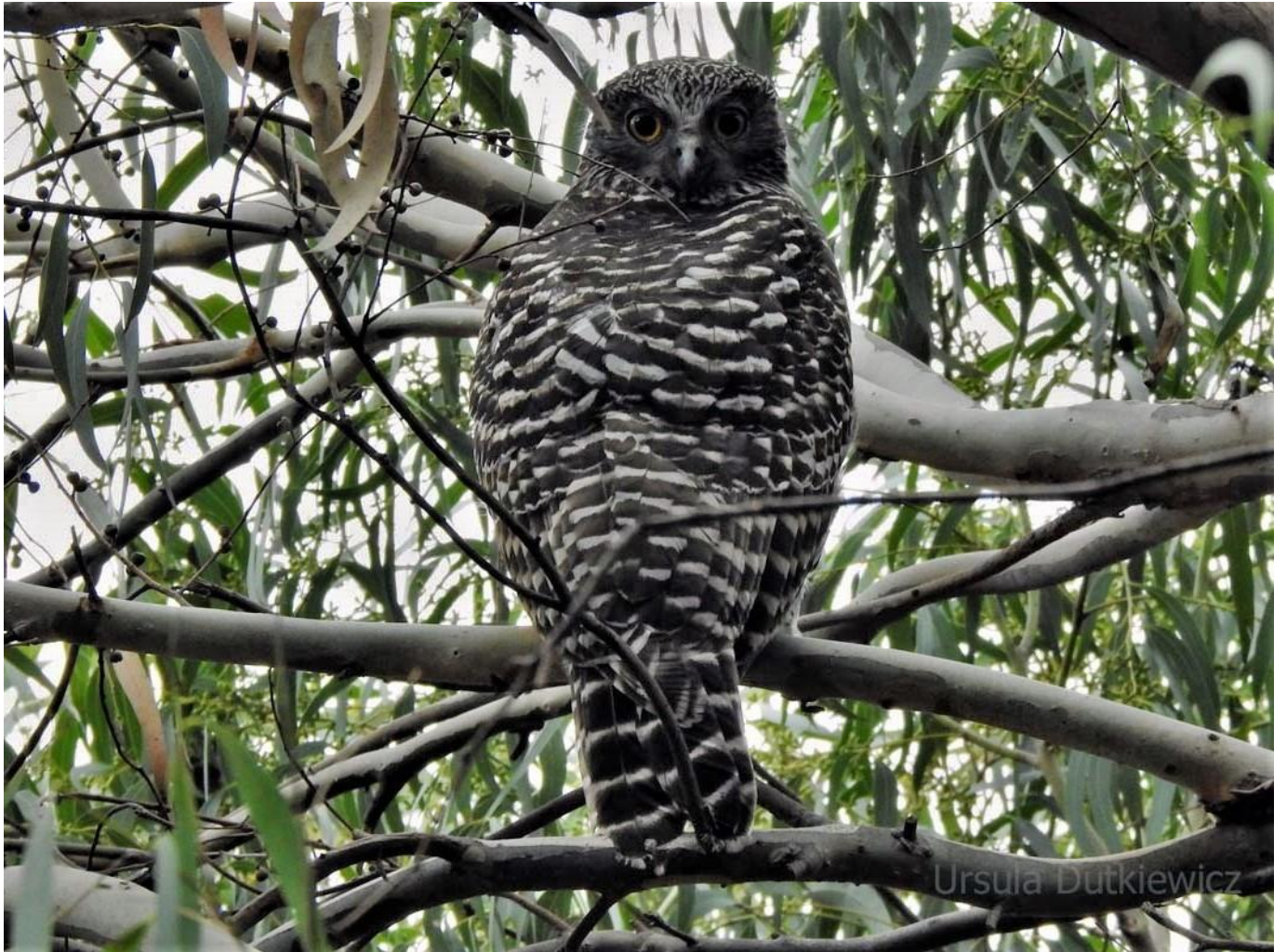
A Powerful Owl High up in a eucalypt in the north west corner of Westgate Park (near the dam)