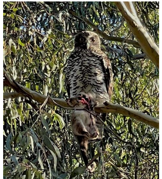
Close up image of the Powerful Owl and a day earlier with a Ringtail Possum