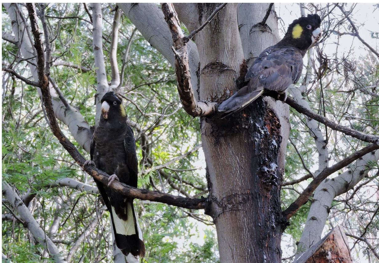
Pair of Yellow-tailed Black-Cockatoos