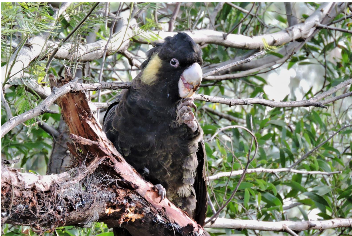
Yellow-tailed Black-Cockatoo with beetle larva extracted from decaying Black Wattle