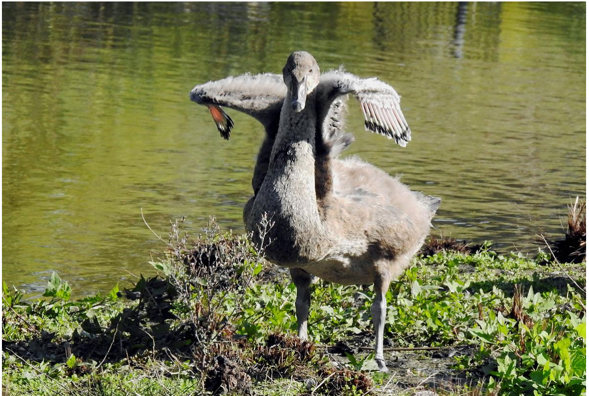
Cygnet already developing its primary flight feathers