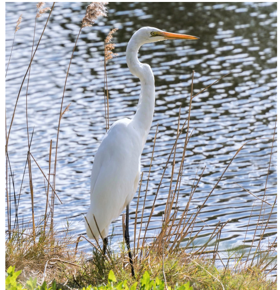
White-necked Heron seen on 16 August and Eastern Great Egret on 17 August