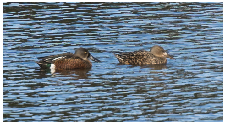
Three of the four Australasian Shoveler seen on the Large Freshwater Lake on 14 & 16 August