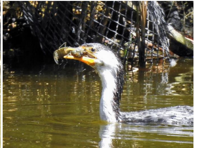
Little Pied Cormorant with a Common Freshwater Yabby Cherax destructor