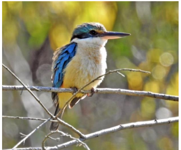
Sacred Kingfisher seen in the park over the last couple of days