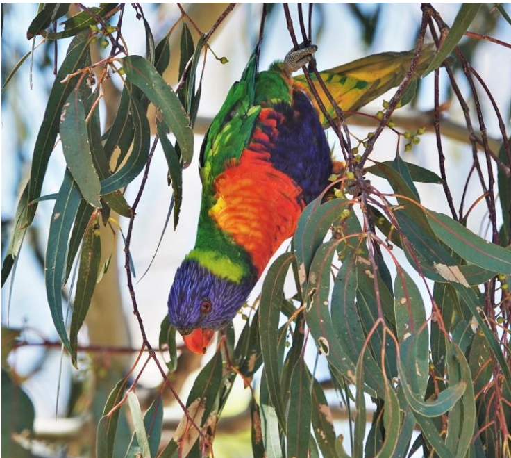
Rainbow Lorikeet searching for lerps on a Red Gum