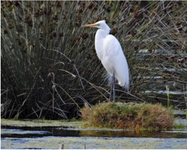
Eastern Great Egret