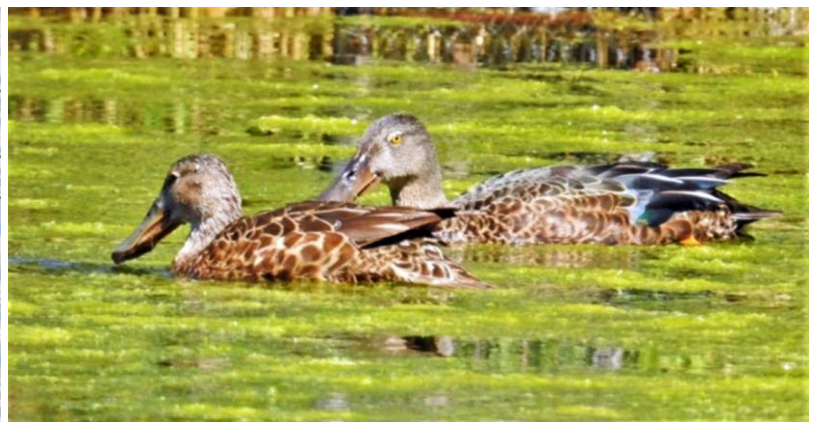
Pair of Australasian Shoveler on the Large Freshwater Lake