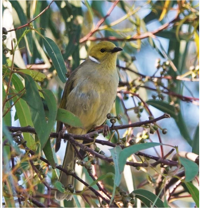
The two most common honeyeaters in Westgate Park today, New Holland and White-plumed Honeyeaters