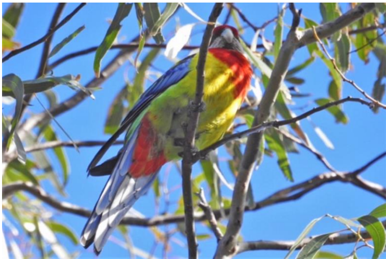
This Eastern Rosella is the first seen in the park since February 2016