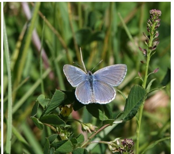
Two of five butterfly species seen today – Greenish Grass-dart feeding on Pelargonium australe (left) and Common Grass-blue (right)