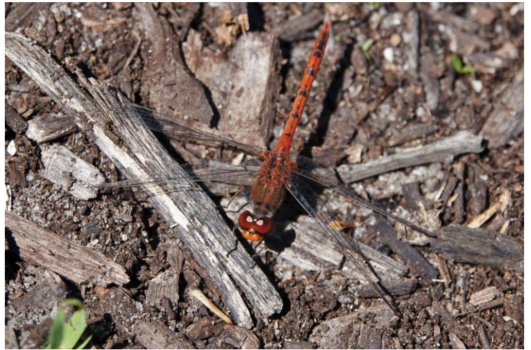
Dragonflies are abundant in the park – Blue-spotted Hawker (left) and Wandering Percher (right)