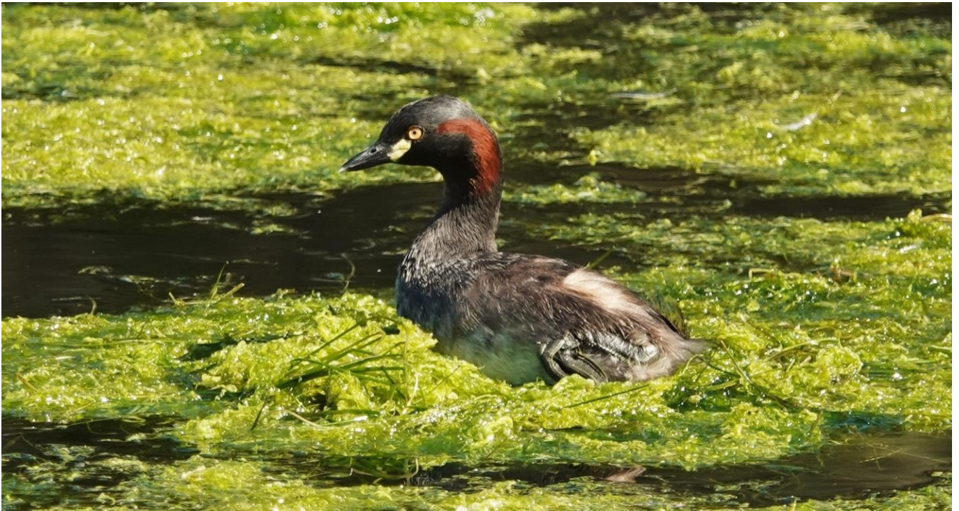
Australasian Grebe on nest of floating algae. Six out of the eight grebes were nesting or constructing a nest