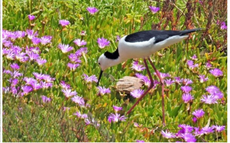
The last Black-winged Stilt seen in the park on 30 October. None were seen today, probably due to very high water in the two large lakes