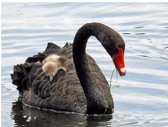
Black Swan with it's very dependent cygnet