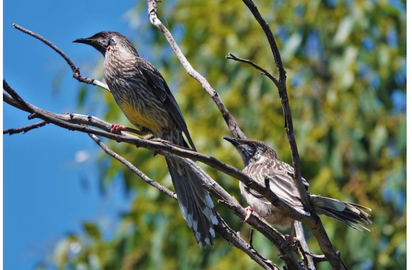
Red Wattlebirds are currently breeding in the park – Chick just starting to fly calling for food (left) and juvenile with parent (right)