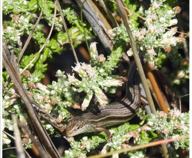
Tussock Skink Pseudemoia pagenstecheri ? Located on the waters edge near the sign to the Pink Lake. Species still to be confirmed