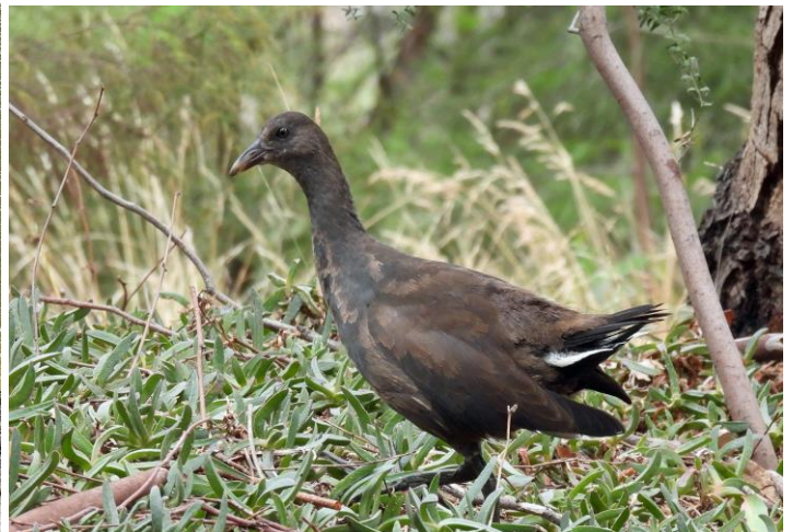
Juvenile Dusky Moorhen