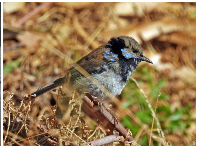
Eclipse (young non-breeding) male Superb Fairy-wren in the process of losing all of his breeding colours