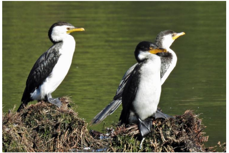
Roosting Little Pied Cormorants