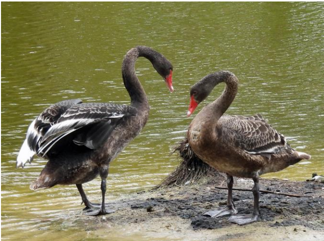
Two of the four Immature Black Swans