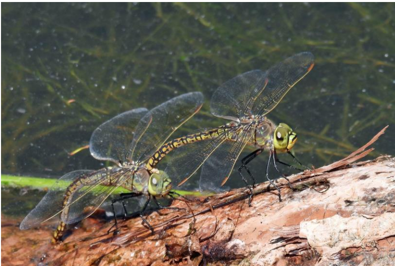
Pair of Australian Emperor dragonflies Anax papuensis , with the female behind depositing eggs