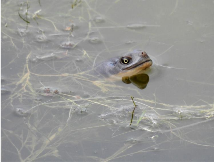
Snake-necked Turtle Chelodina longicollis