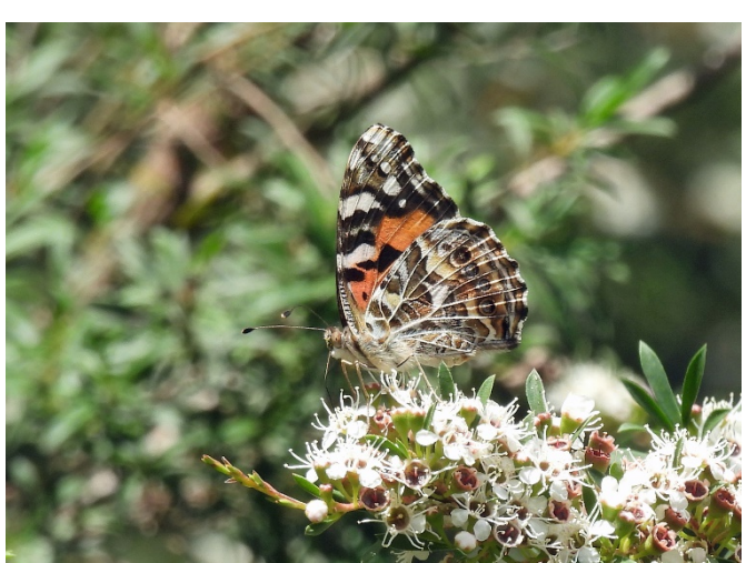
Painted Lady Vanessa cardui feeding on nectar from a flowering Baeckea