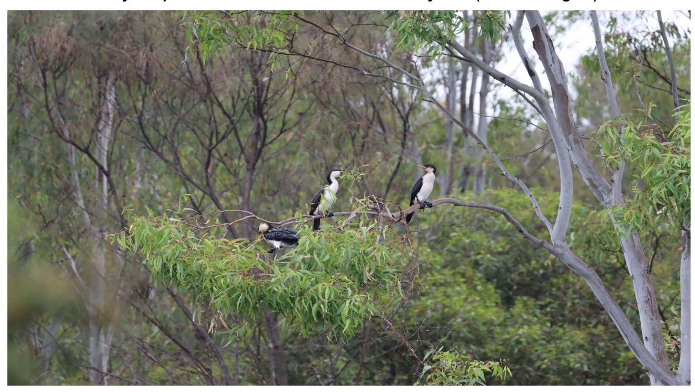
Little Pied Cormorants (Peter Parrington)