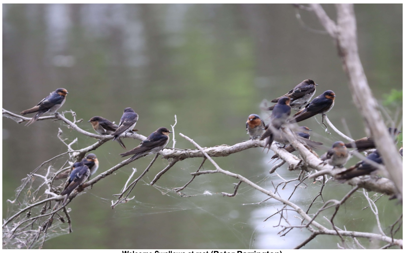
Welcome Swallows at rest (Peter Parrington)