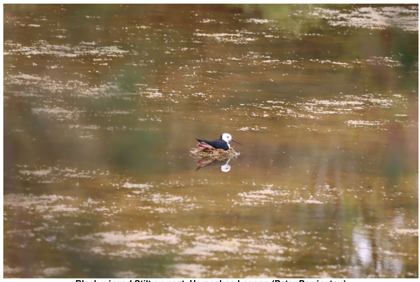
Black-winged Stilt on nest, Horseshoe Lagoon