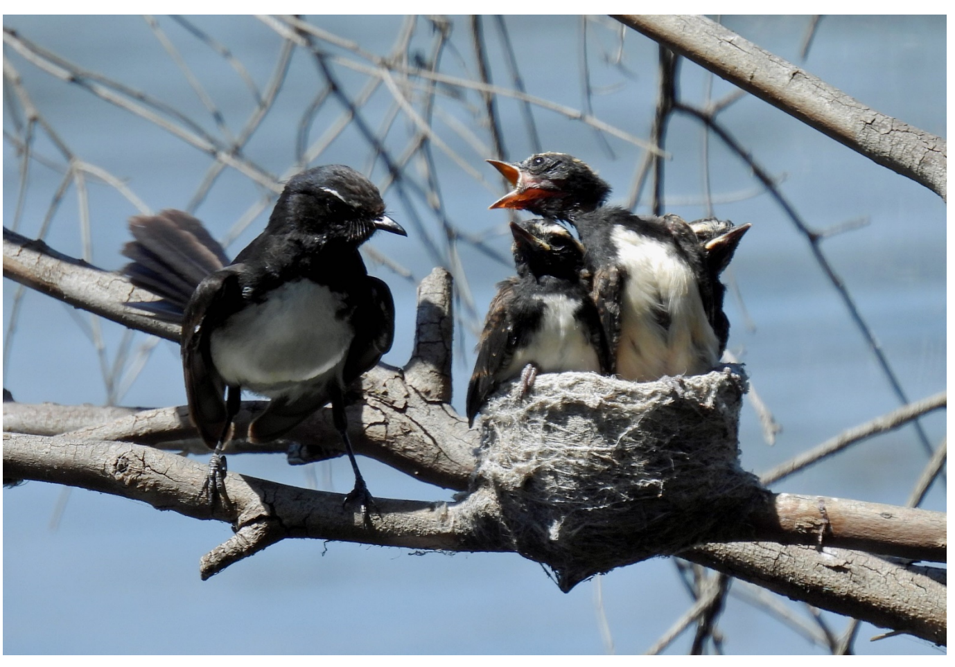
There were three dependent young on the day this photo was taken (4 Dec), but only two were seen today