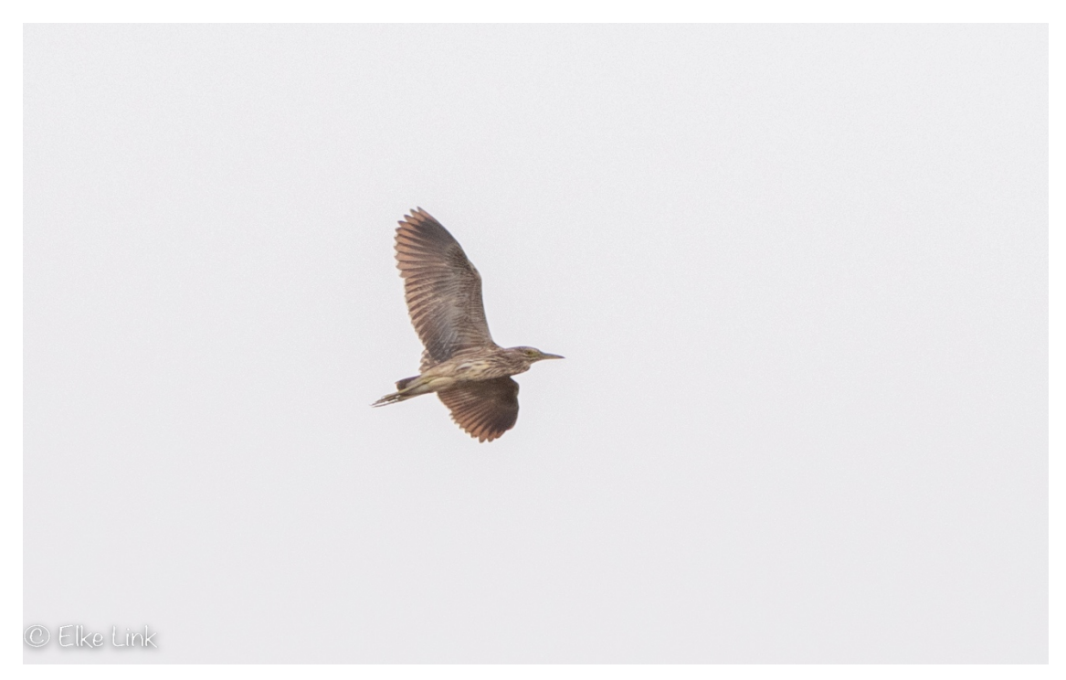
Nankeen Night-heron (Elke Link)