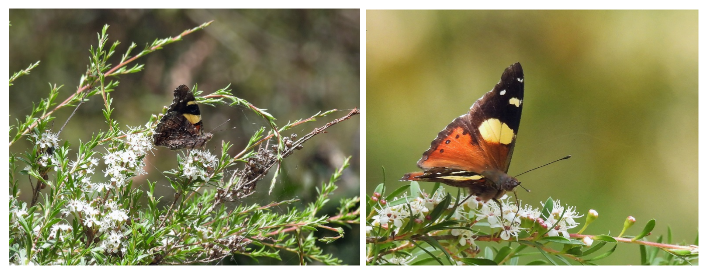
Yellow Admiral Vanessa itea feeding on nectar from a flowering Baeckea