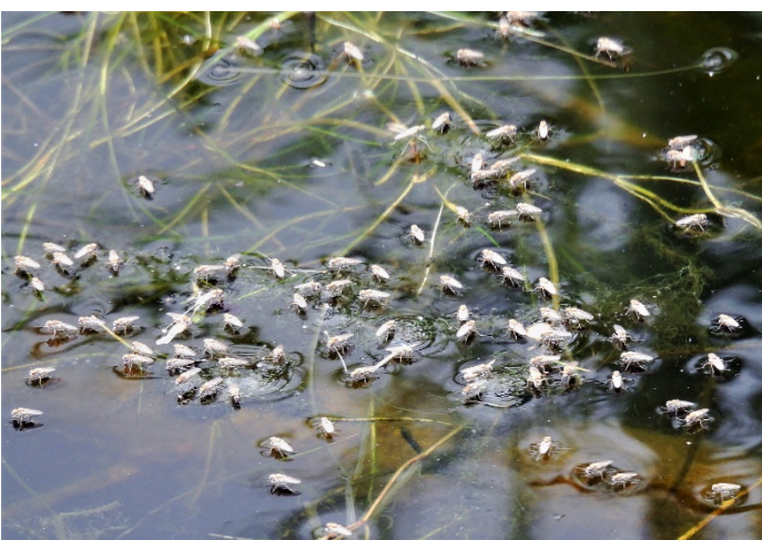
Small flies on the water surface