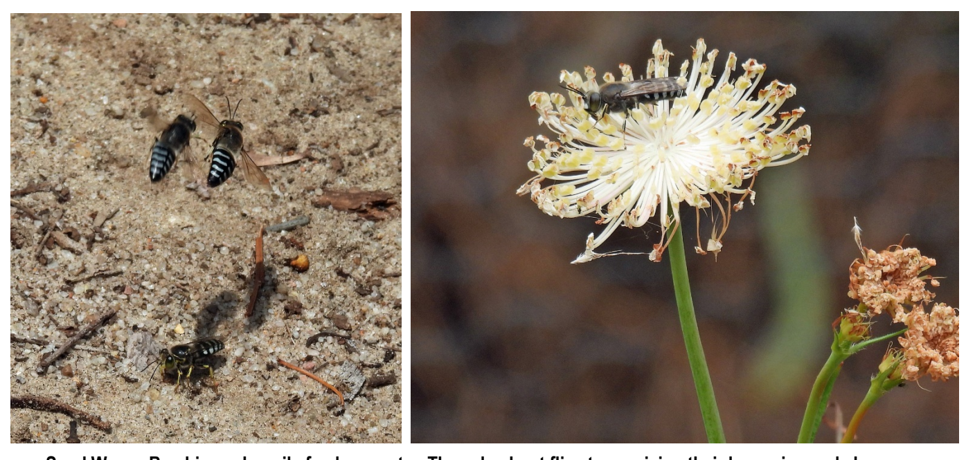
Sand Wasps Bembix sp. happily feed on nectar. They also hunt flies to provision their larvae in sandy burrows. I have seen them take March flies off my legs to feed their young in East Gippsland (A McC).