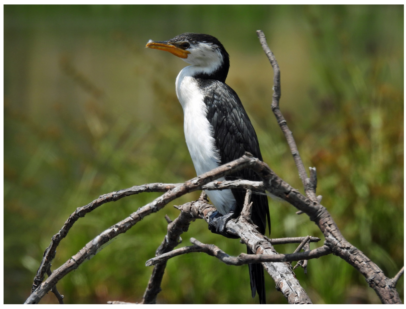
Little Pied Cormorant