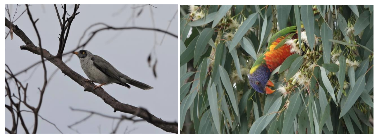
Noisy Miner and Rainbow Lorikeet at the CFMEU site