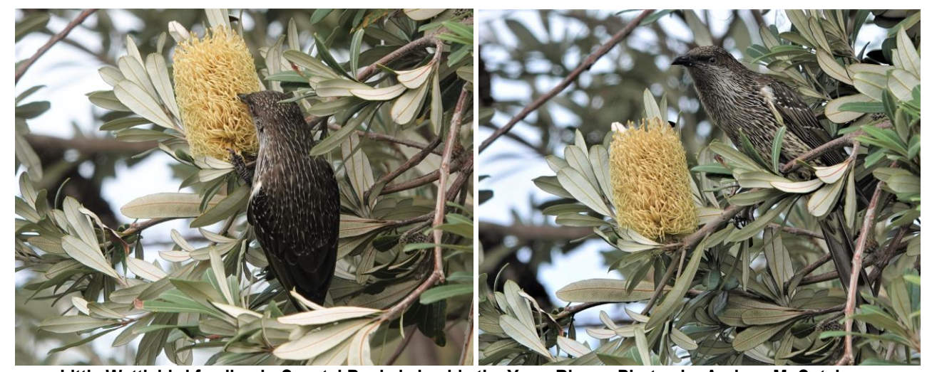
Little Wattlebird feeding in Coastal Banksia beside the Yarra River