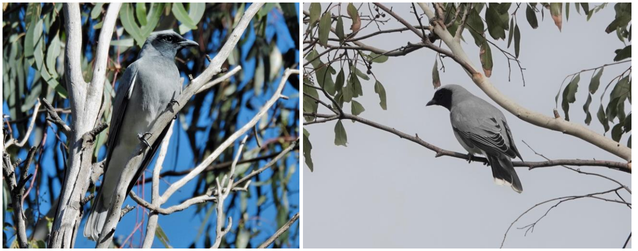
There have been a number of recent sightings of Black-faced Cuckoo-shrikes in the park