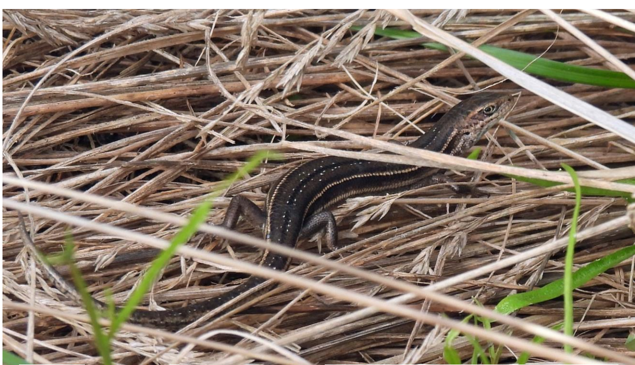
One of two Tussock Skinks Pseudemoia pagenstecheri seen sunning in a garden bed near the toilet block. This species is listed as threatened in the Western Volcanic Plains of Melbourne