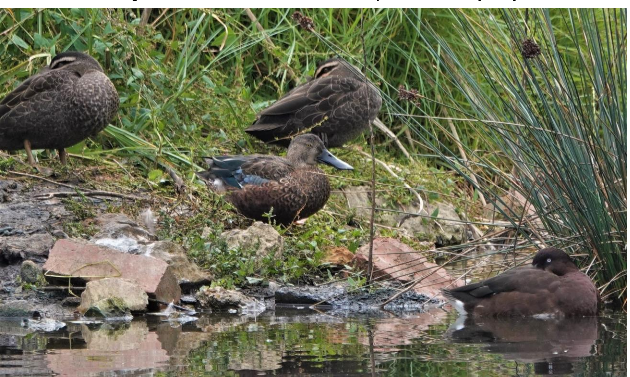
A single non-breeding male Australasian Shoveler with roosting Pacific Black Ducks and a Hardhead on a small island in the large freshwater lake