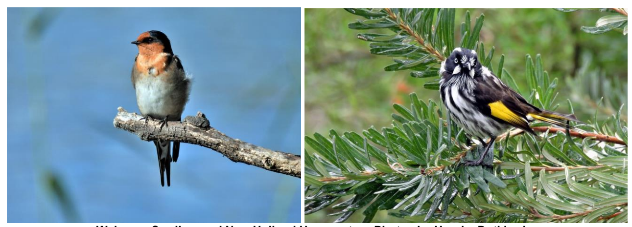
Welcome Swallow and New Holland Honeyeater