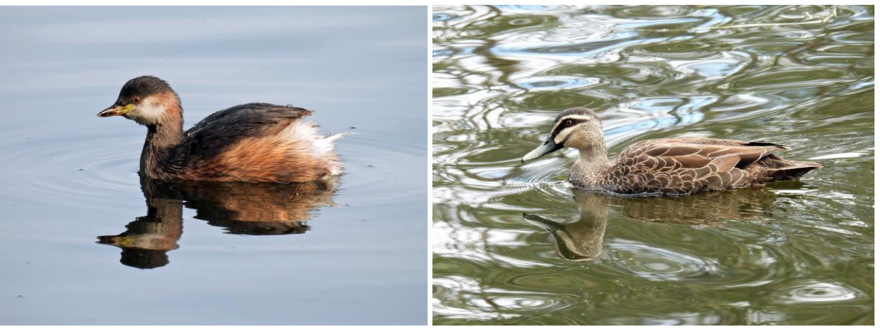
Australasian Grebe and Pacific Black Duck