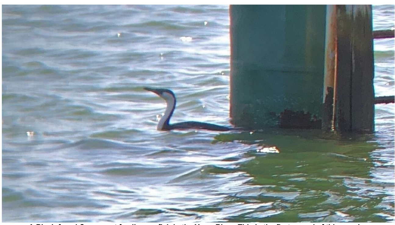
A Black-faced Cormorant feeding on fish in the Yarra River. This is the first record of this species for Westgate Park