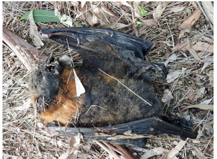
Grey-headed Flying-fox Pteropus poliocephalus Fortunately, seen alive more often rather than dead