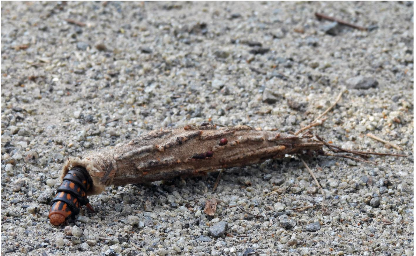
Sauder's Case Moth Metura elongatus