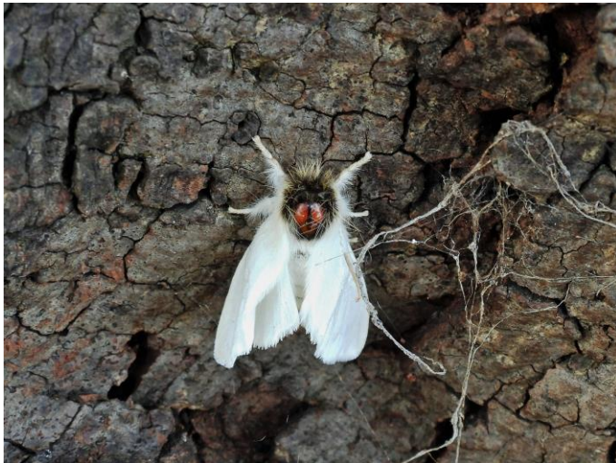
Moth, possibly Genus Trichiocercus