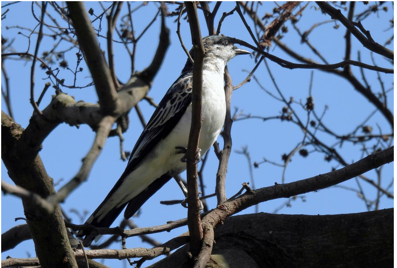
A male White-winged Triller in the park on 23 September. They are very infrequent visitors previously recorded twice since our bird surveys began in 2007 - 2 in Dec 2007 and 2 in Nov 2019.

^ This species also seen on today's bird count or recorded more than once in Opportunistic Sightings above