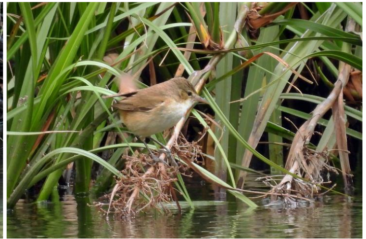
Australasian Shoveler and Australian Reed-Warbler.