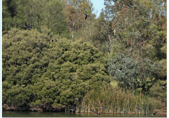
A flock of thirty Little Pied Cormorants descended onto the large freshwater lake, but did not stay for long. Unlike Little Black Cormorants, it is unusual for Little Pied Cormorants to move around or work together as a flock.