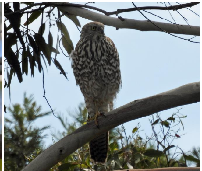
Black-faced Cuckoo-shrike and Brown Goshawk, which was hunting in the area behind the bridge and windmill.