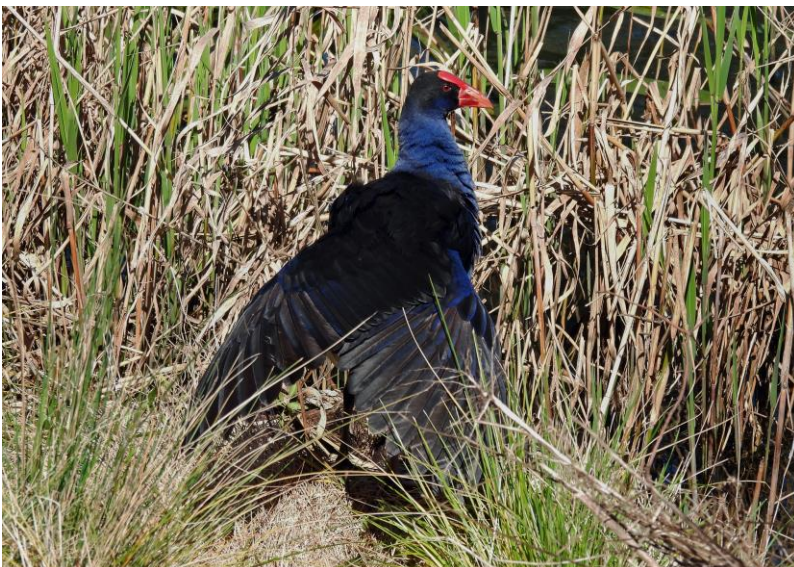
A pair of Purple Swamphens were appearing to display courtship behavior. Could this be a female displaying her wings to lure the male?