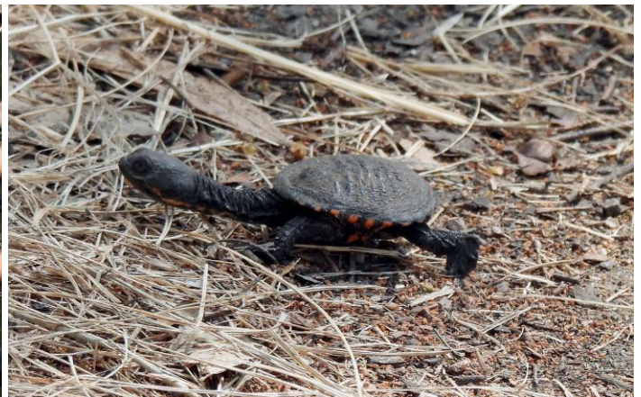
Conditions are favorable for the resident Snake-necked Turtles Chelodina longicollis , prompting them to breed.