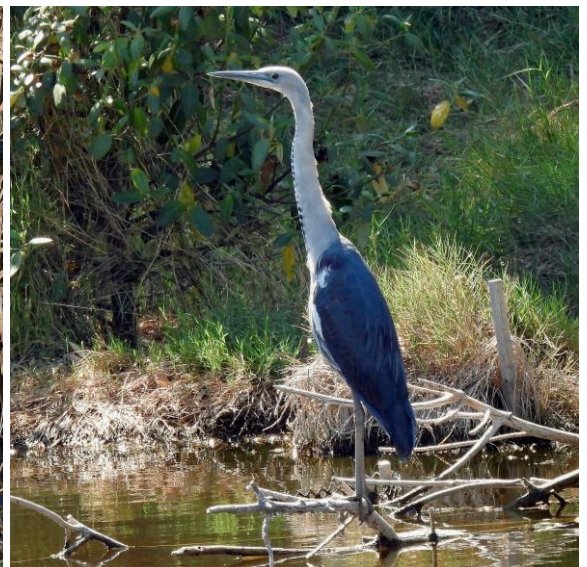
One of two White-necked Herons seen on 30 September.