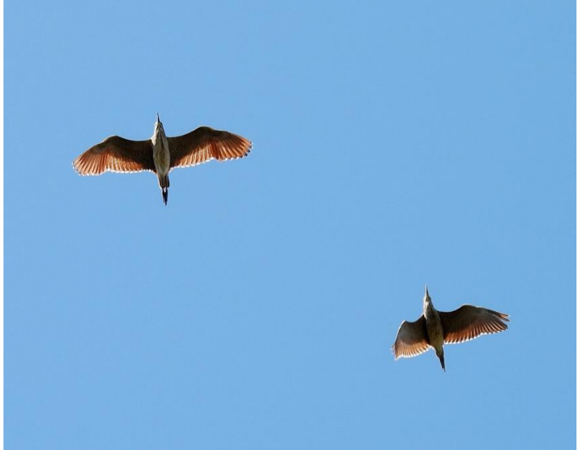
Three Nankeen Night-Herons made a brief visit on 30 September. The image to the left is an adult, and the pair in flight are immature birds due to the streaked underparts.