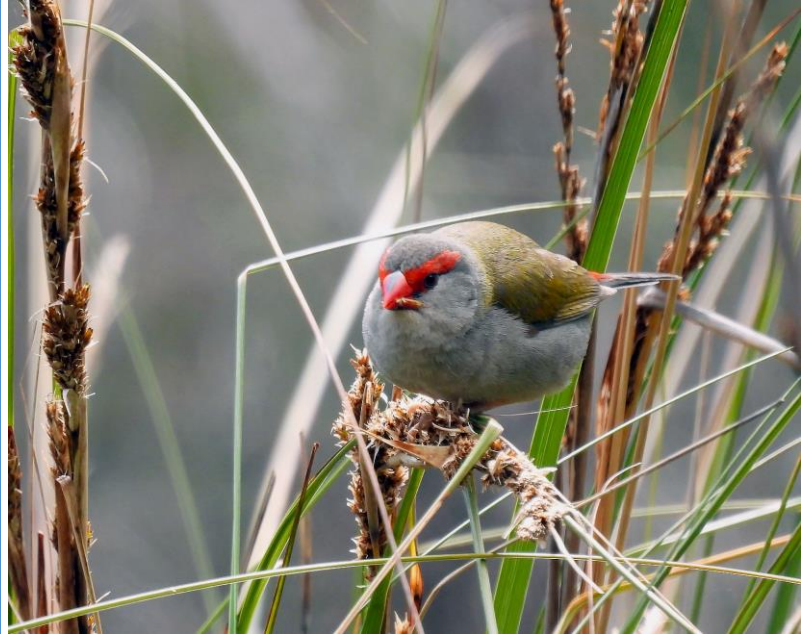
Horsfield's Bronze-Cuckoo seen on 15 September, and Red-browed Finch seen on 22 September. The species of sedge ( Lepidosperma sp. ??) on which the finch is feeding could be important for the long-term retention of these birds in Westgate Park