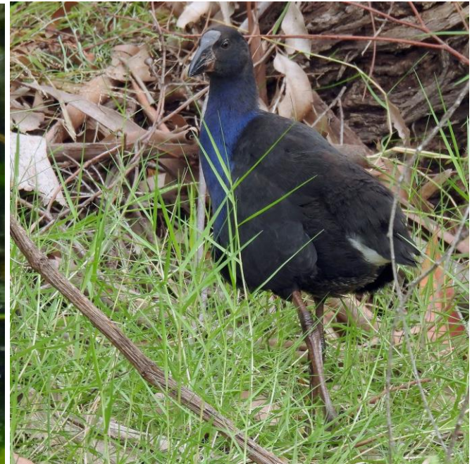
Juvenile Purple Swamphen