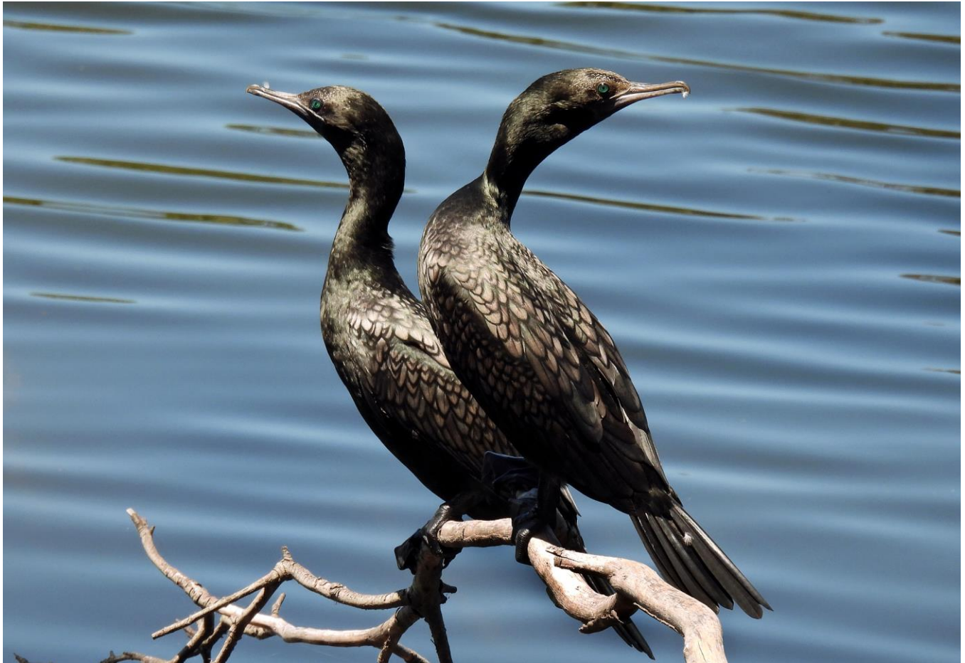
Pair of Little Pied Cormorants