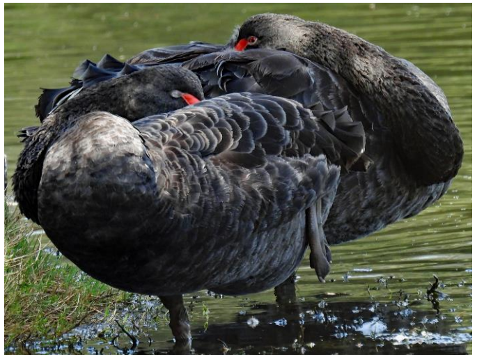
Pair of Grey Teal and Black Swans at rest.