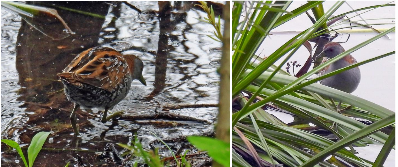
Baillon's Crake at the edge of the large freshwater lake near the works compound

^ This species also seen on today's bird count or recorded more than once in Opportunistic Sightings above