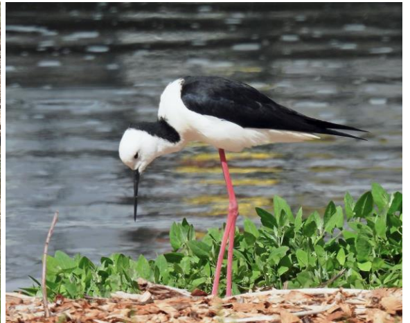
Black-winged Stilts are currently present in lower than usual numbers for this time of the year. Only two were counted today.