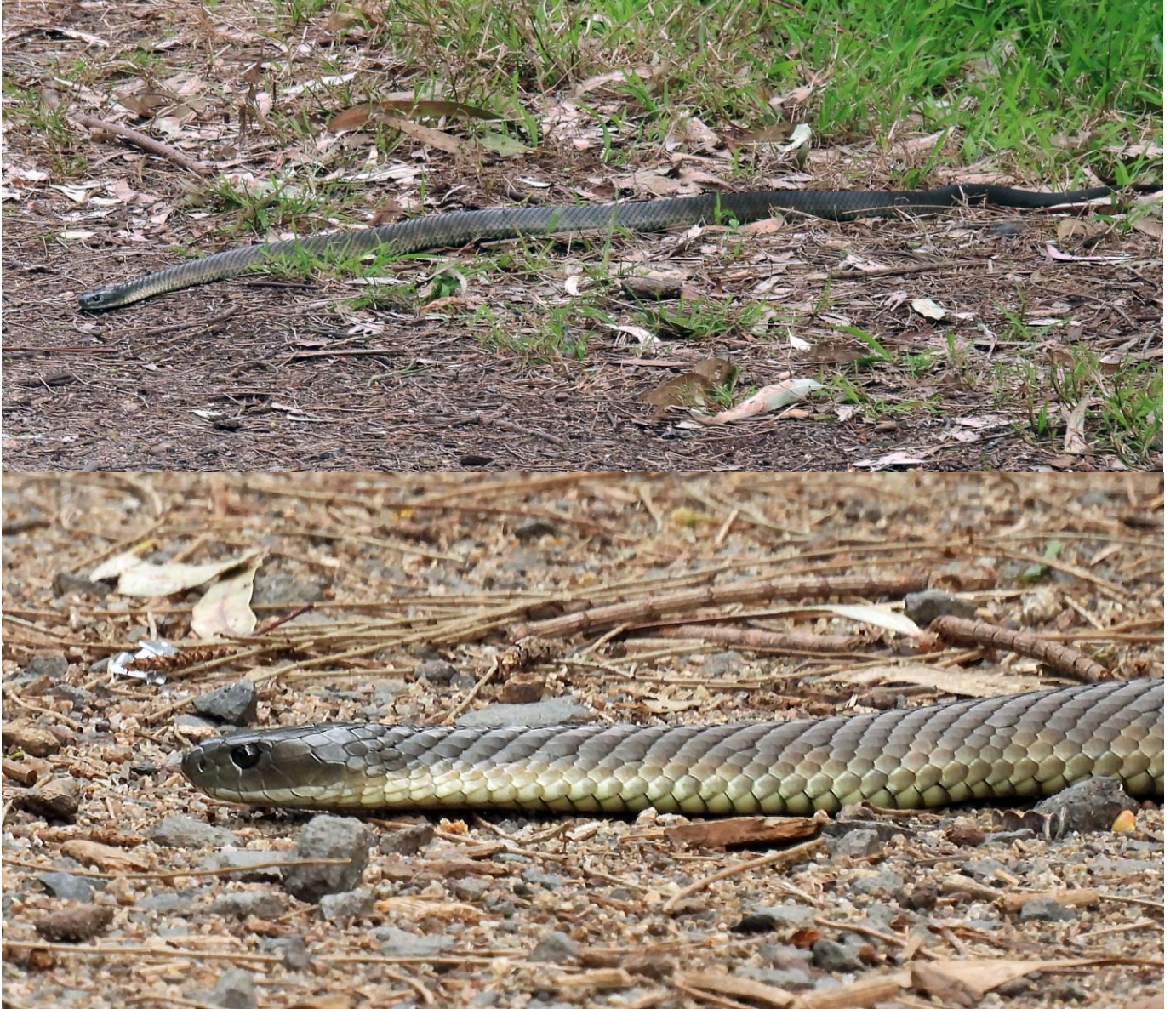
Tiger Snake ( Notechis scutatus )