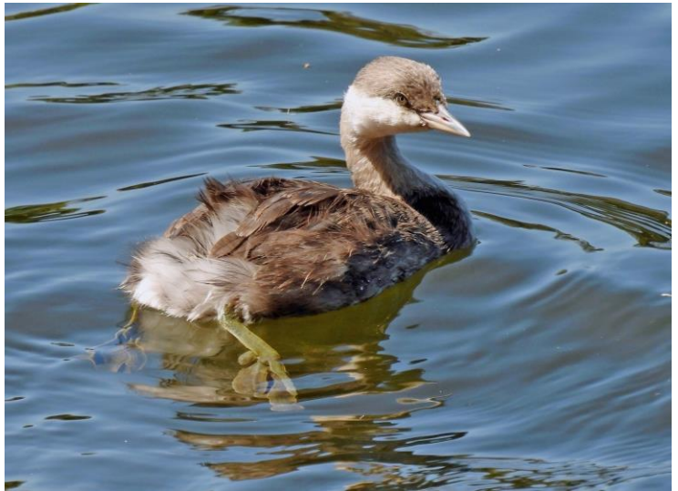
Non-breeding adult Hoary-headed Grebe clearly showing its partially webbed feet well adapted for diving. In non-breeding attire this species can be distinguished from the Australasian Grebe by the dark head cap running just below the eye. Australasian Grebes have the edge of the cap running through the eye.