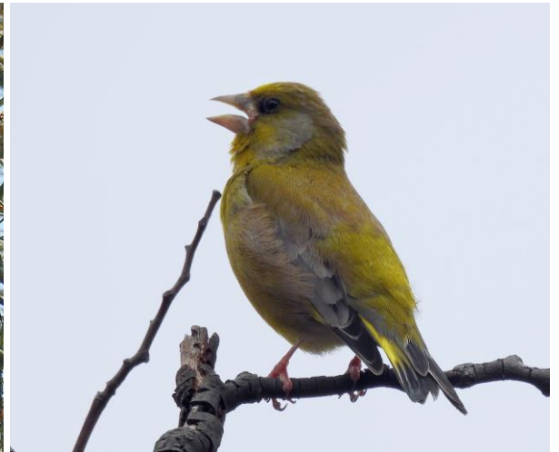
European Greenfinch Numbers and frequency of sightings of these finches have declined in recent years