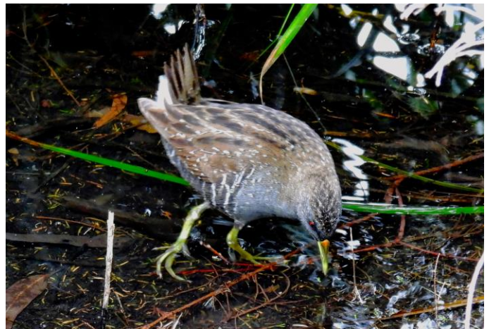
Spotted Crake feeding along the water's edge on the wetland near the compound.