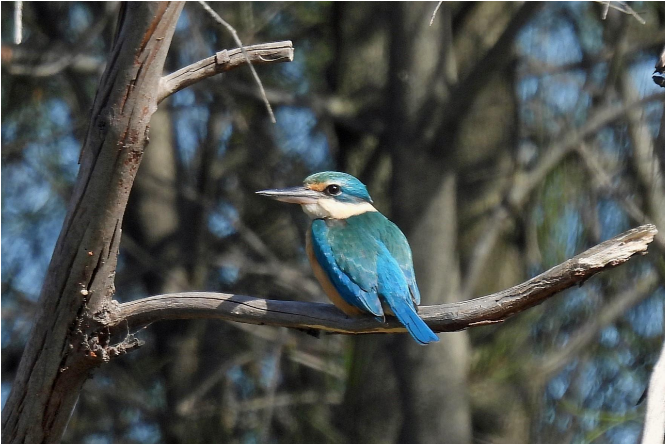
The Sacred Kingfisher seen on 27 October.