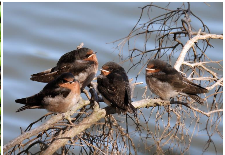
Dusky Moorhen chick and recently fledged Welcome Swallows