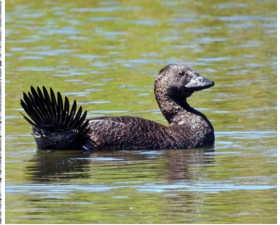
The female Musk Duck. Note the wings are small in relation to the body size, a good reason why they almost always dive to get away from danger rather than take flight.