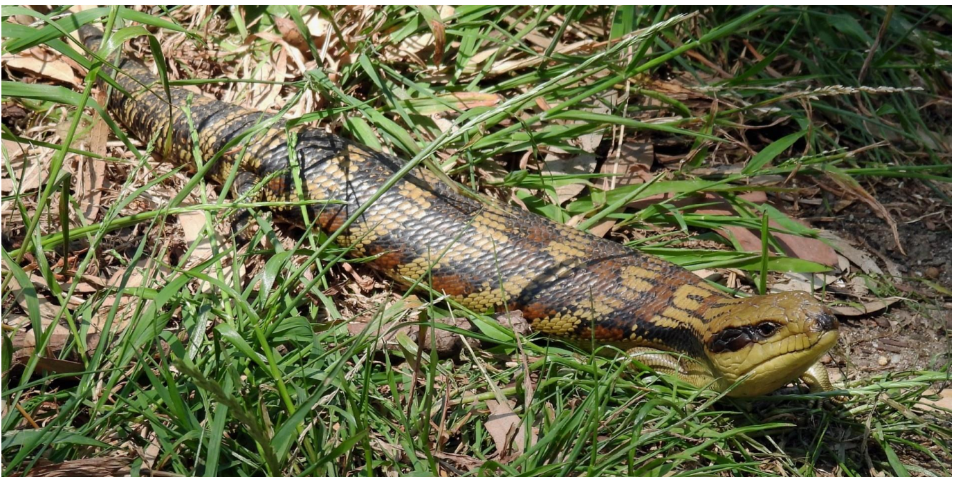
Common Blue-tongue Skink Tiliqua scincoides .