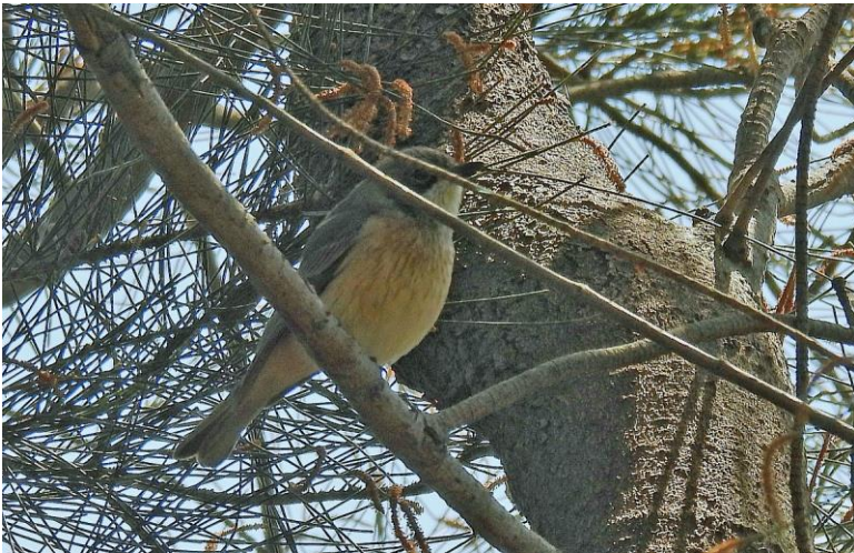
Immature male Rufous Whistler They are very occasional visitors to the park that first appeared in October 2020