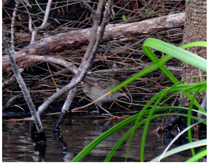
Australian Reed-Warbler left and Little Grassbird right.