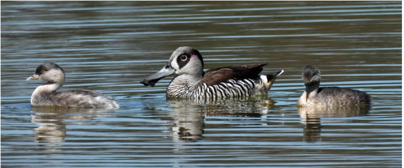
Pink-eared duck with two Hoary-headed Grebes