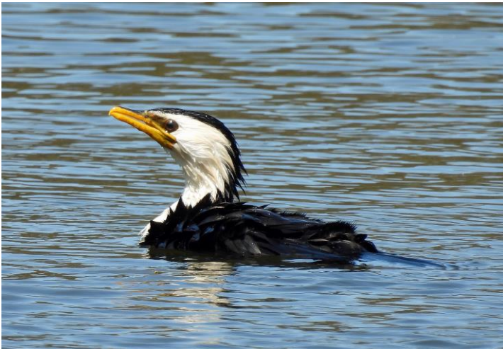
Little Pied Cormorant