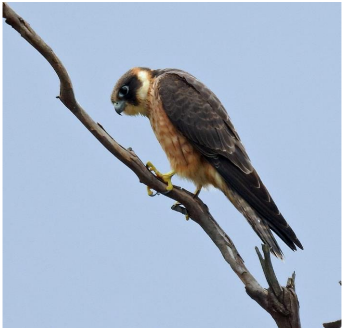
The Australian Hobby seen on 21 October.