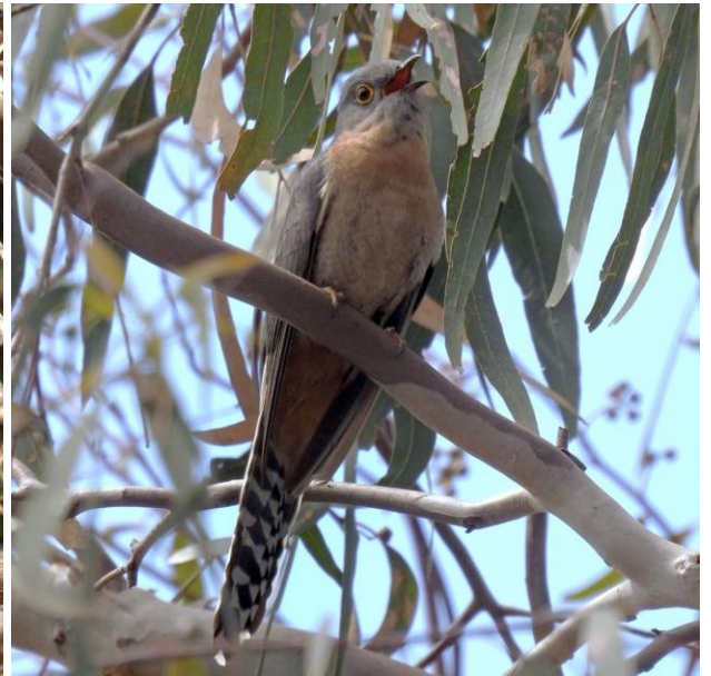
Juvenile Fan-tailed Cuckoo seen at today's count and an adult calling last month.