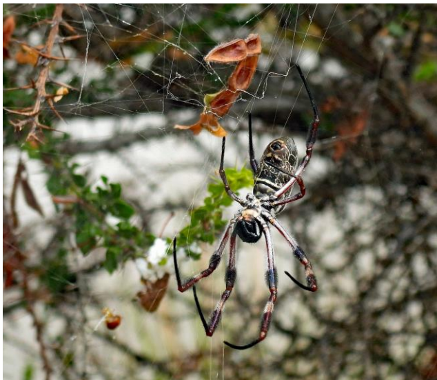
Large spider, possibly an Australian Golden Orbweaver