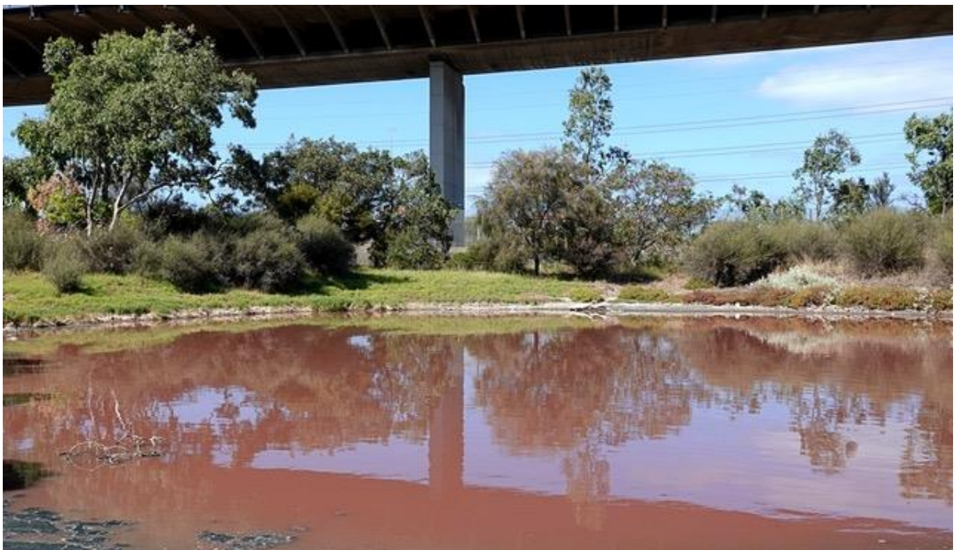
one of the small ponds close to Westgate Bridge changing to a pinkish colour

^ This species also seen on today's bird count or recorded more than once in Opportunistic Sightings above