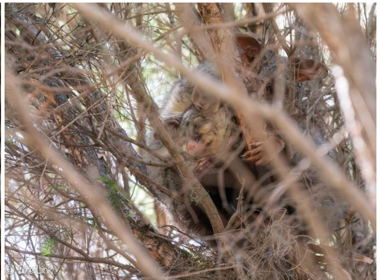
Brushtail Possum with one young