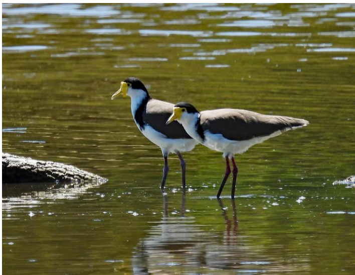
Pair of Masked Lapwings