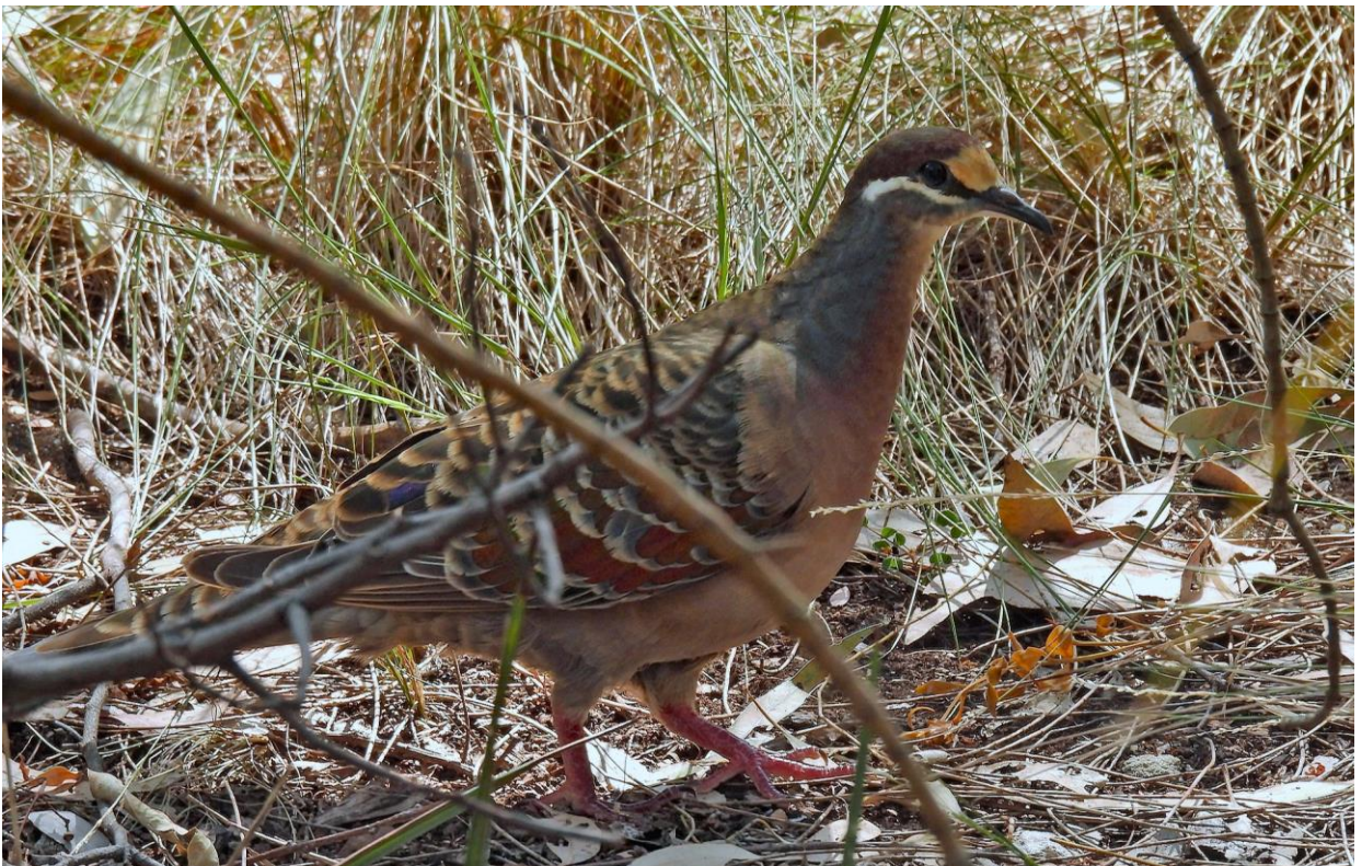
Common Bronzewing, seen on 16 February