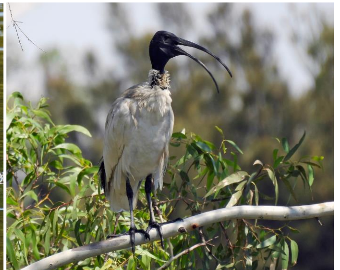
Australian White Ibis