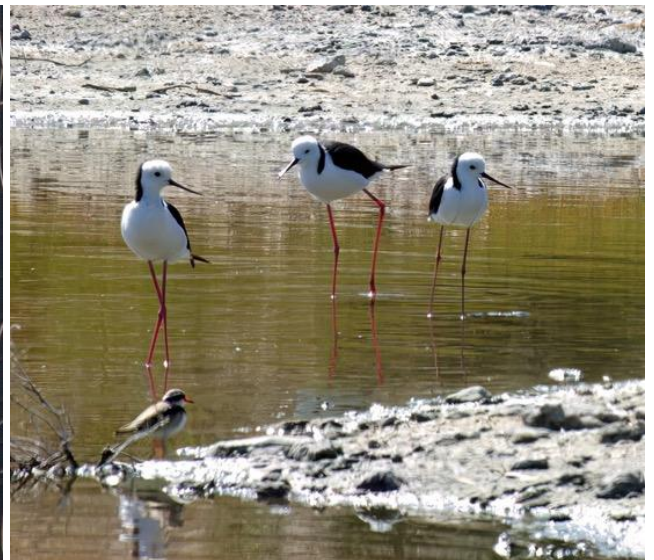
Juvenile Collared Sparrowhawk, Black-winged Stilts and Black-fronted Dotterel seen today – photos by Elke Link