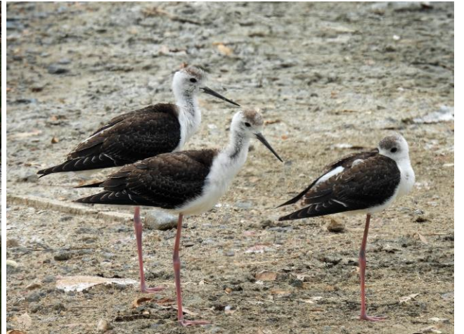
Some recent breeding activity by Chestnut Teal and Black-winged Stilts