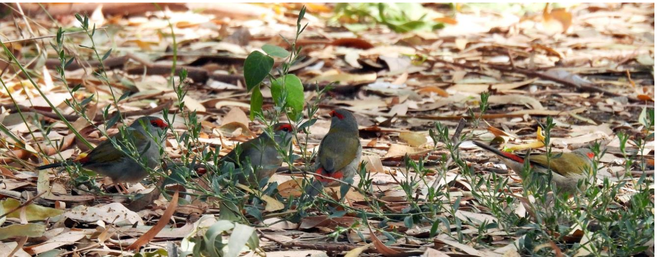
Male Superb Fairy-wren changing back to non-breeding (brown) plumage, and Red-browed Finches seen on 19 Feb above and four of six seen on 1 st March below – photos above by Ursula Dutkiewicz