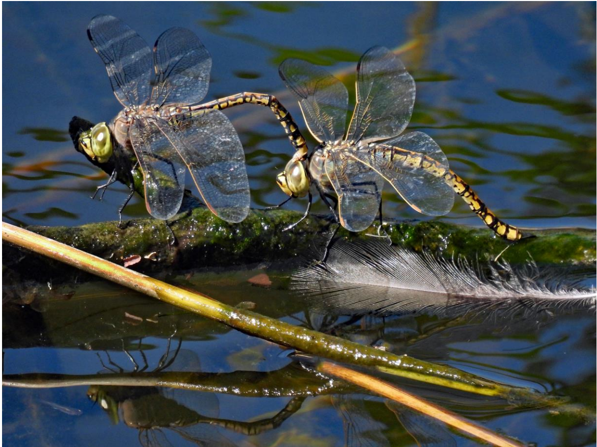
Australian Emperor dragonflies in 'tandem' position during egg laying