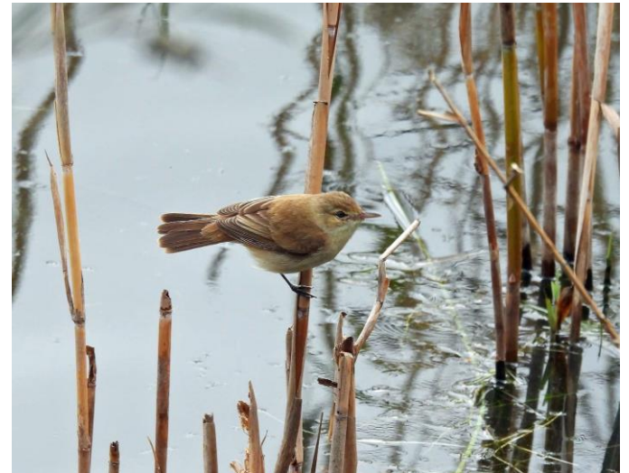
The first Australian Reed-Warblers have returned to the park on 26 August, just before the start of spring.