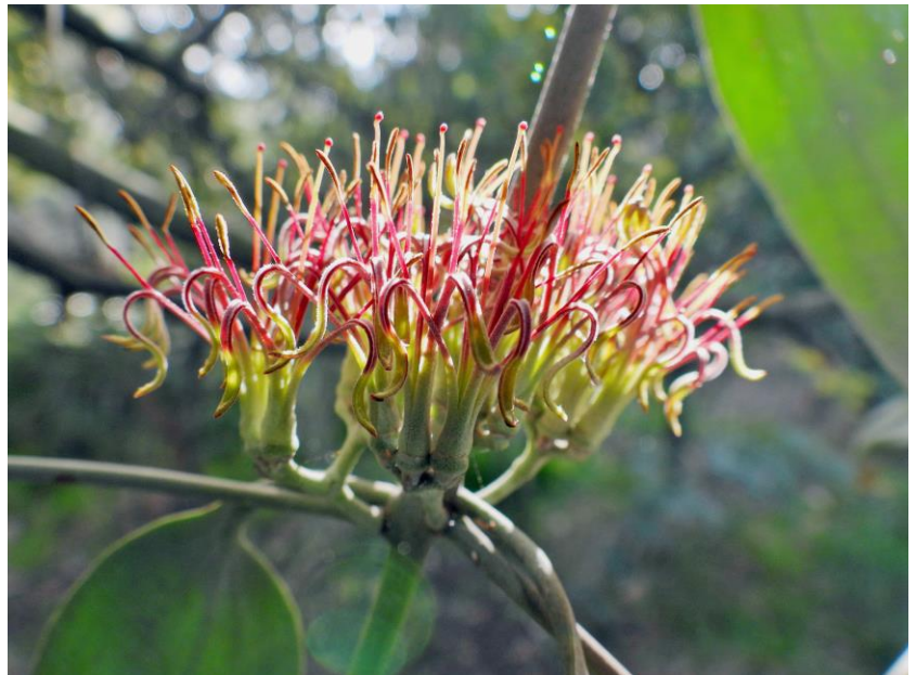
Mistletoe in flower. Hopefully recently established mistletoe plants will soon attract Mistletoe Birds to the park