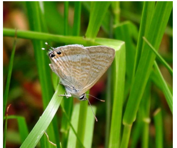
Long-tailed Pea-blue Lampides boeticus