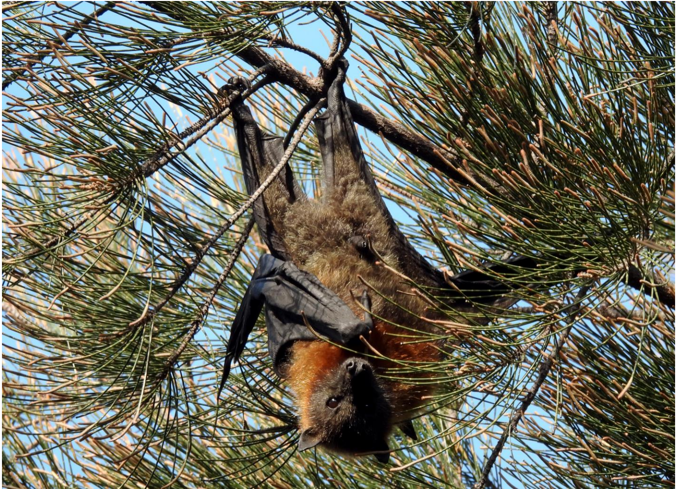
Only a single Grey-headed Fruit Bat was seen today. On the August survey eight were counted roosting in the park