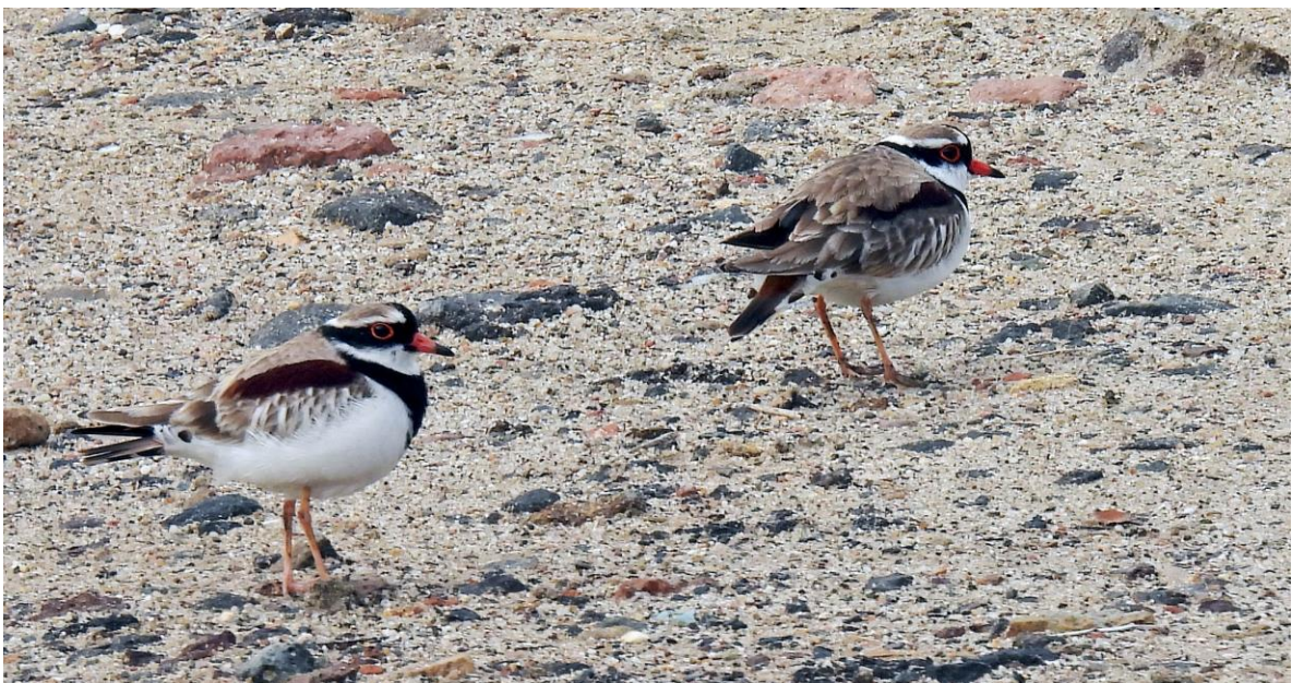
The first pair of Black-fronted Dotterels seen for a while. Perhaps a sign they may breed here in the park some time soon. Over the previous four months only a single bird was ever recorded