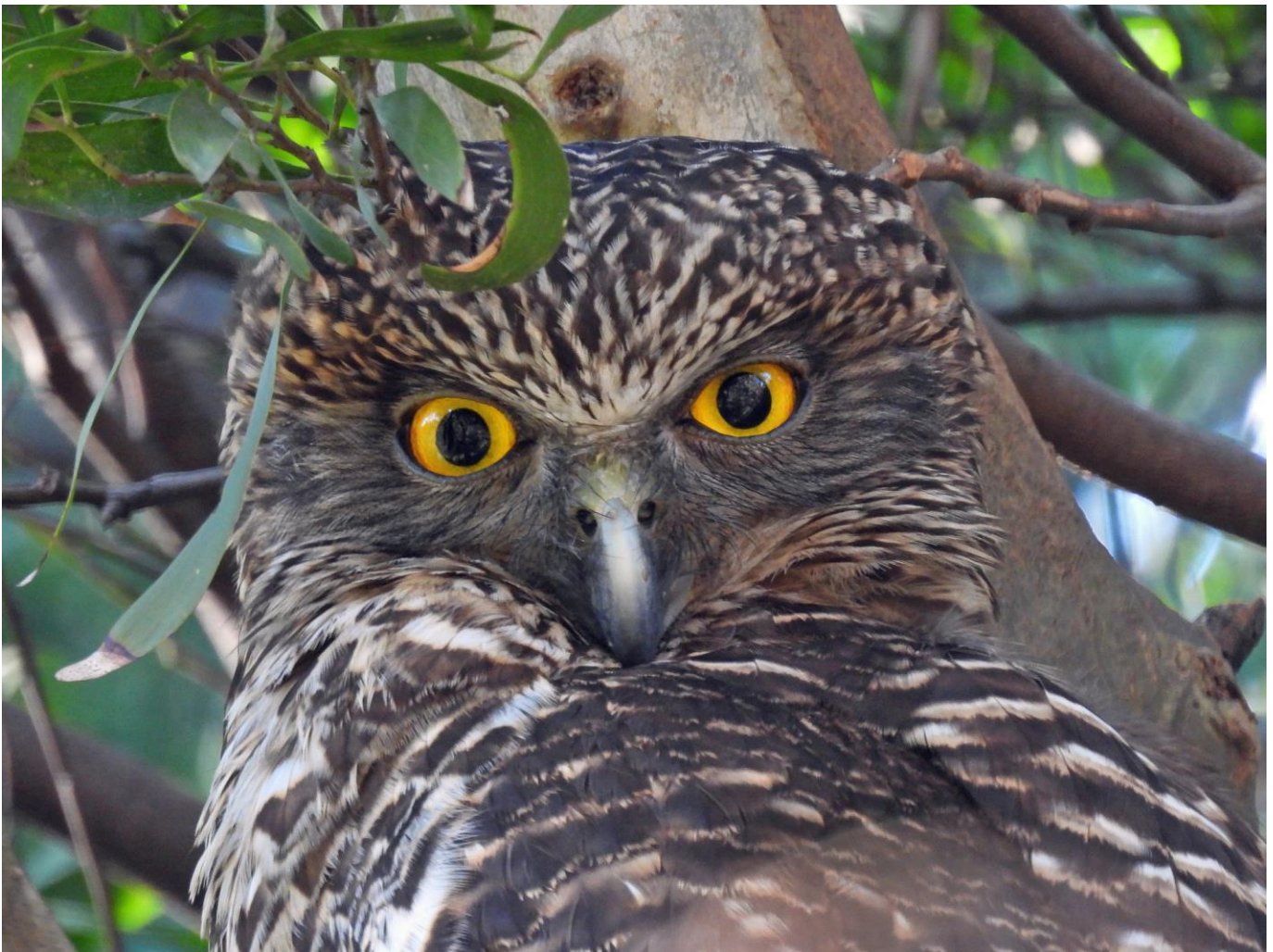
This Powerful Owl is a male which can be distinguished by the broad and flatter top of head. The female has a rounder more narrow head