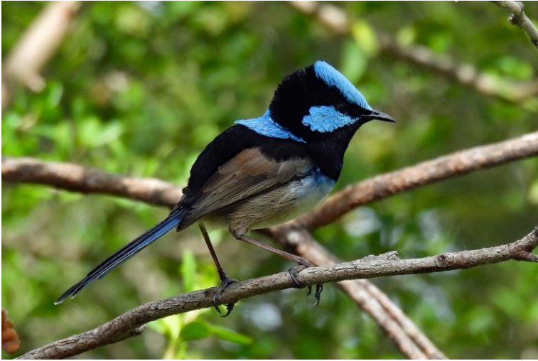
Male Superb Fairy-wren in full blue plumage. In July no blue males were recorded despite a high count of 73 birds