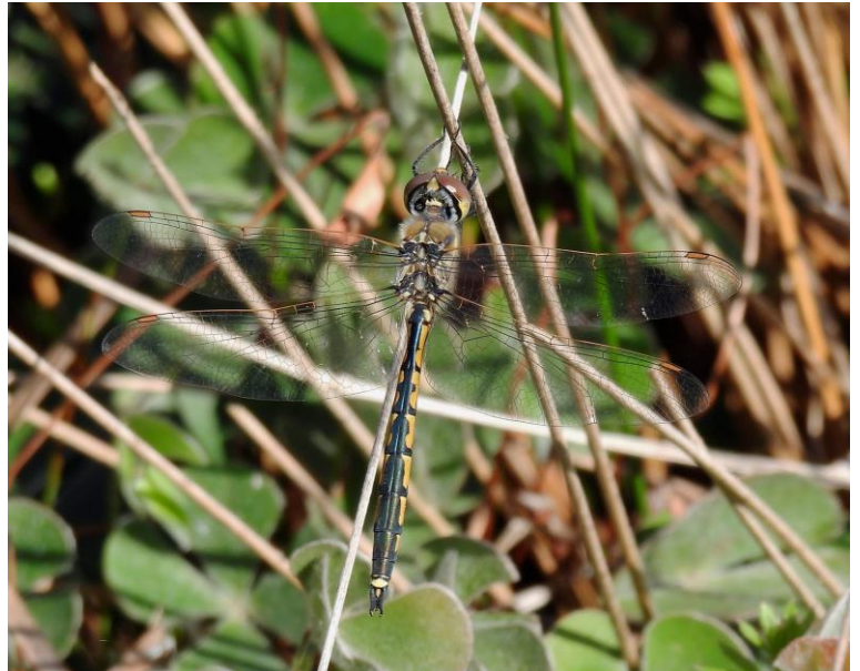
Tau Emerald ( Hemicordula tau ) dragonfly