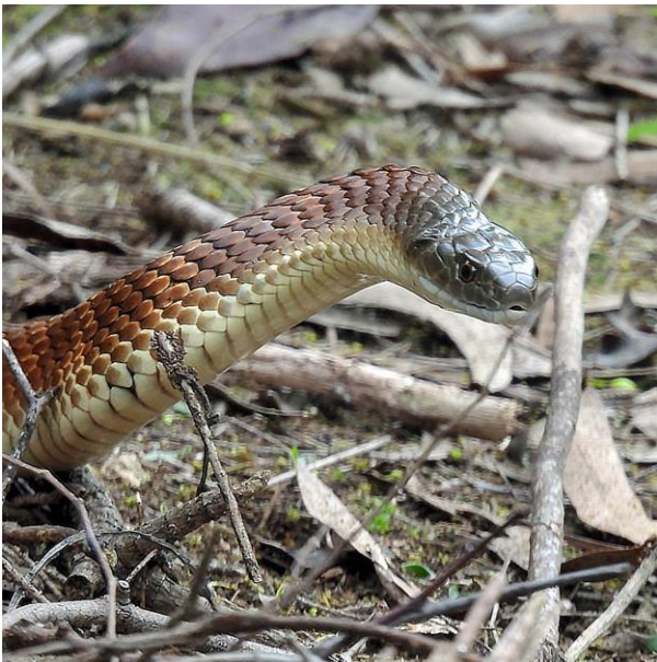
Close-up of the Tiger Snake in a defensive pose, ready to strike