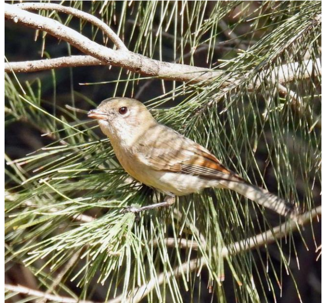
This immature Golden Whistler has remained in the park for at least four months