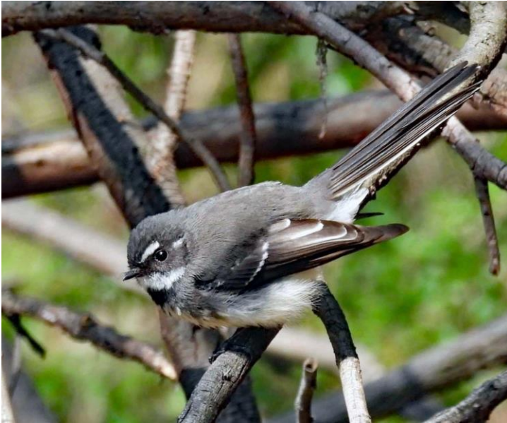
Grey Fantails were present in high numbers on the day of the survey