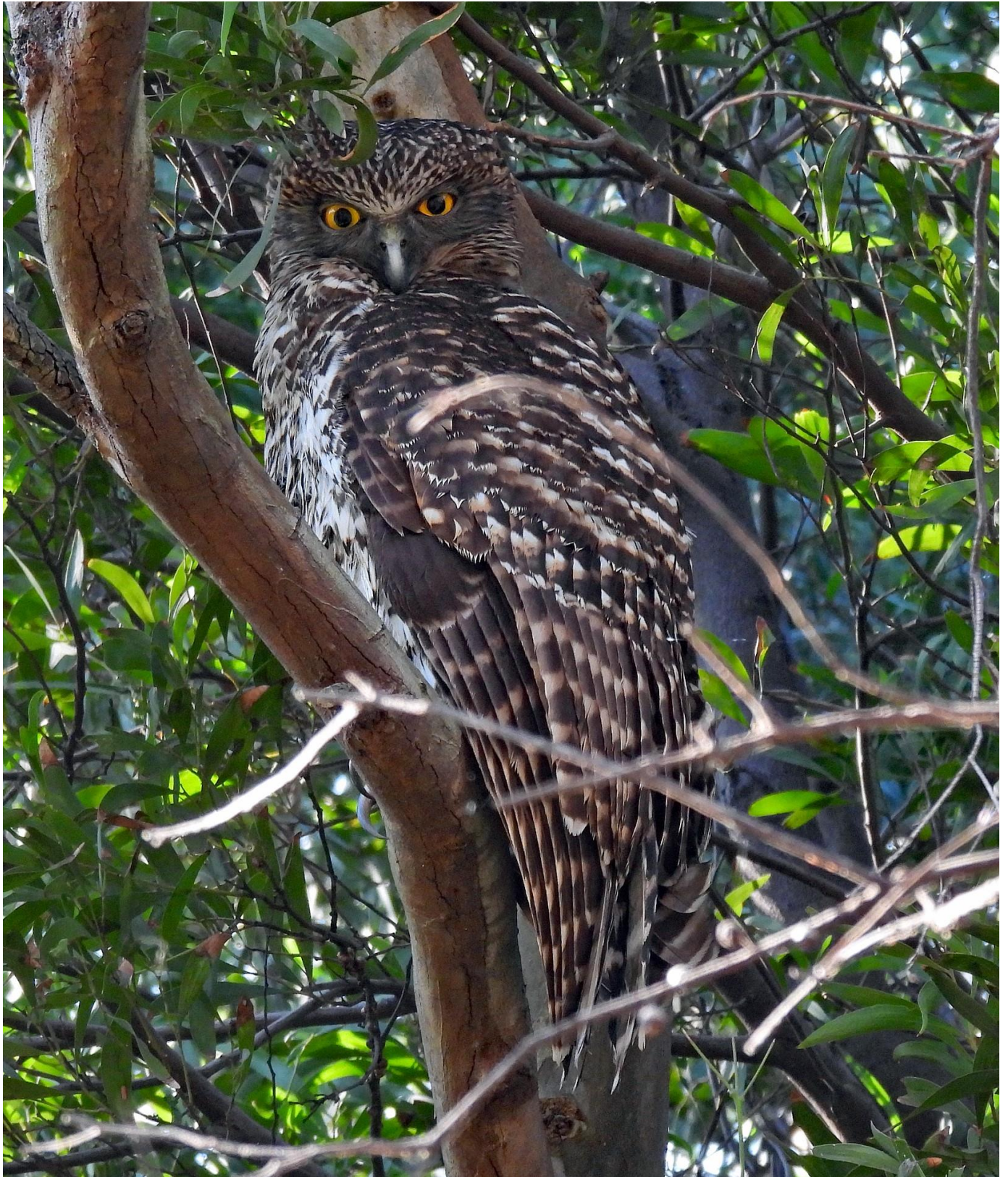
The Powerful Owl roosting in the same place as on the previous Monday, the day of our monthly survey. It has not been seen since 12 August, when this photo was taken.