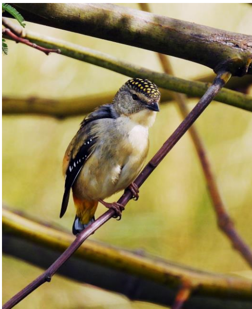
Female Spotted Pardalote seen on 7 August