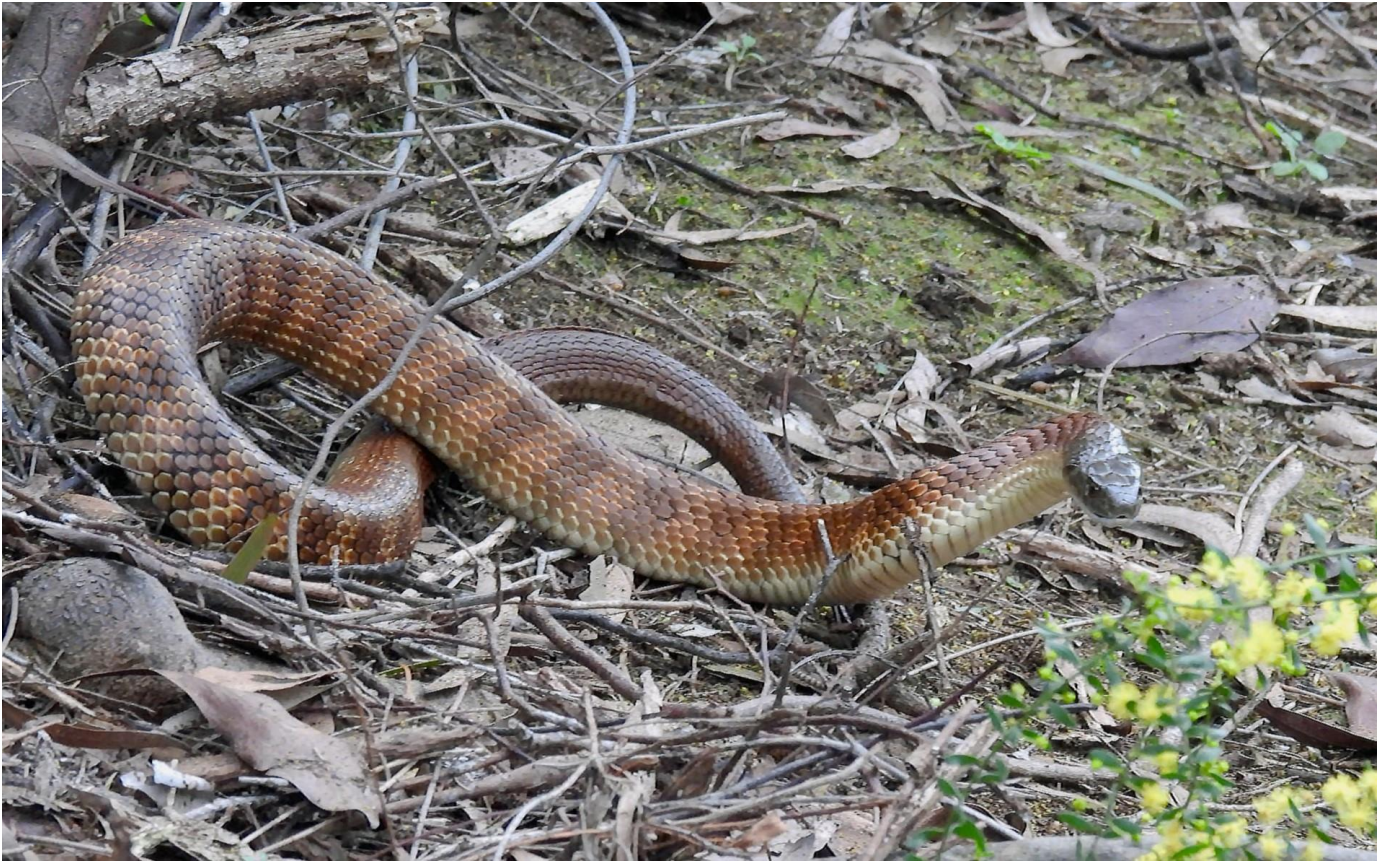
Tiger Snake "it hissed at me to alert me of its presence as I stepped around a log. It was 9.30 am and overcast at the time. I slowly backed away as it remained watching me as I did. I waited until I was a safe distance away and then took it's photo."- Ursula