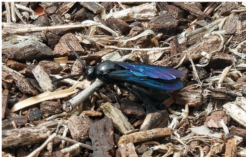
Blue Flower Wasp Austroscolia soror