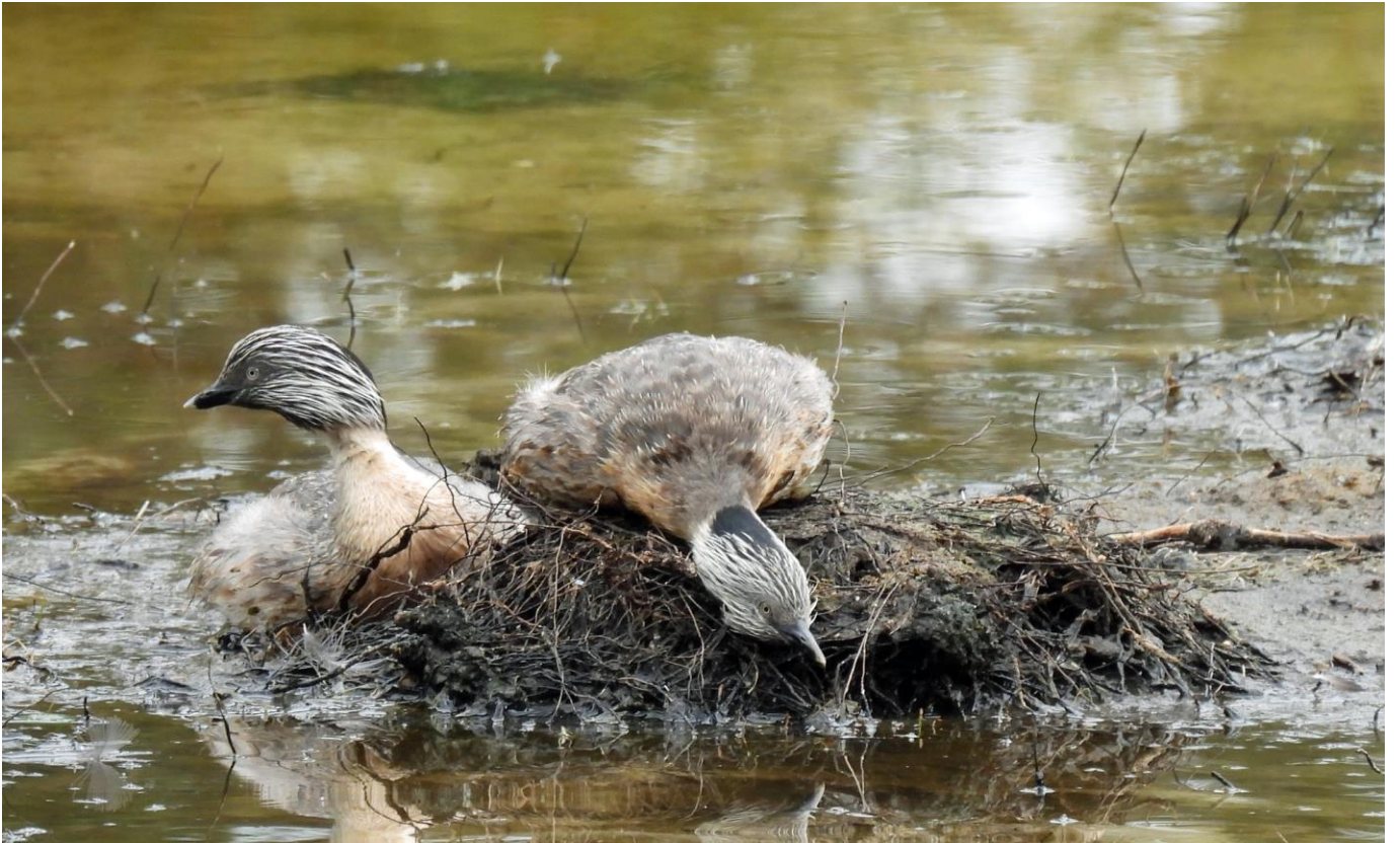
Hoary-headed Grebes courting and nest building