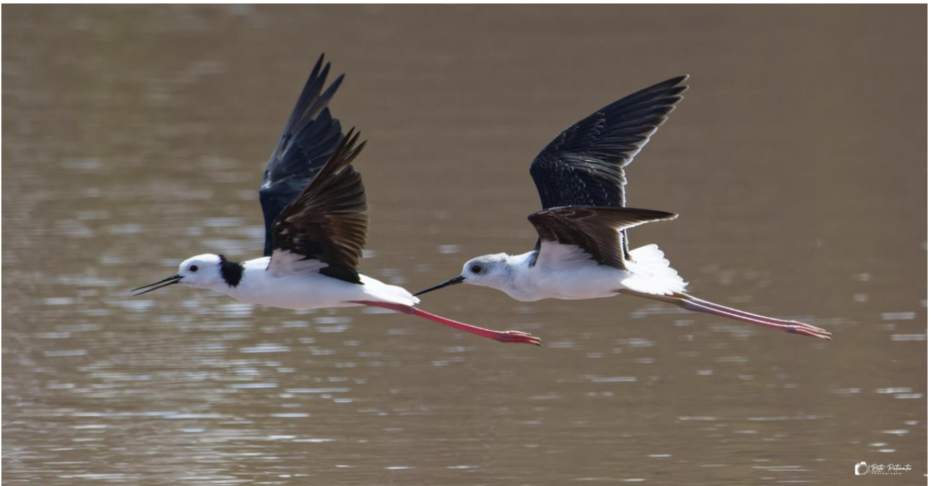
Adult and immature Pied Stilts in flight.