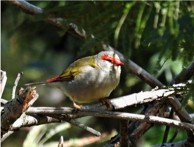
Red-browed Finches are regularly seen in the park in small numbers, usually three or four.