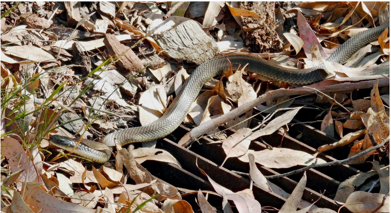
The young Tiger Snake referred to above

After photographing a young Tiger Snake I sat on the deck watching the Hoary-headed Grebes building a nest in front of me. Suddenly there were three pairs, and they were all behaving very strangely. I zoomed in on my camera and saw they were ultra-attentive and following a Tiger snake that was swimming across the lake. – Ursula Dutkiewicz 31/01/25