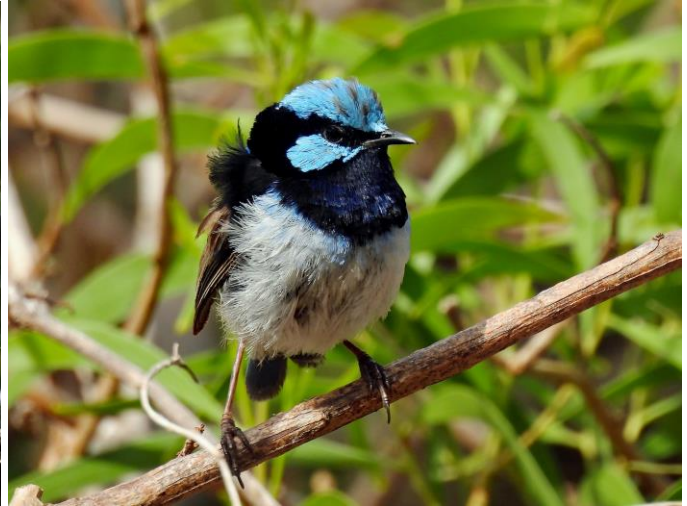
A male Superb Fairy-wren beginning to transition out of its breeding plumage