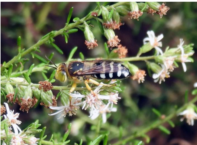
Sand Wasp, genus Bembix