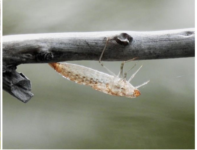
Blue Skimmer Orthemum caledonicum dragonfly and nymph casing from which an adult dragonfly has emerged