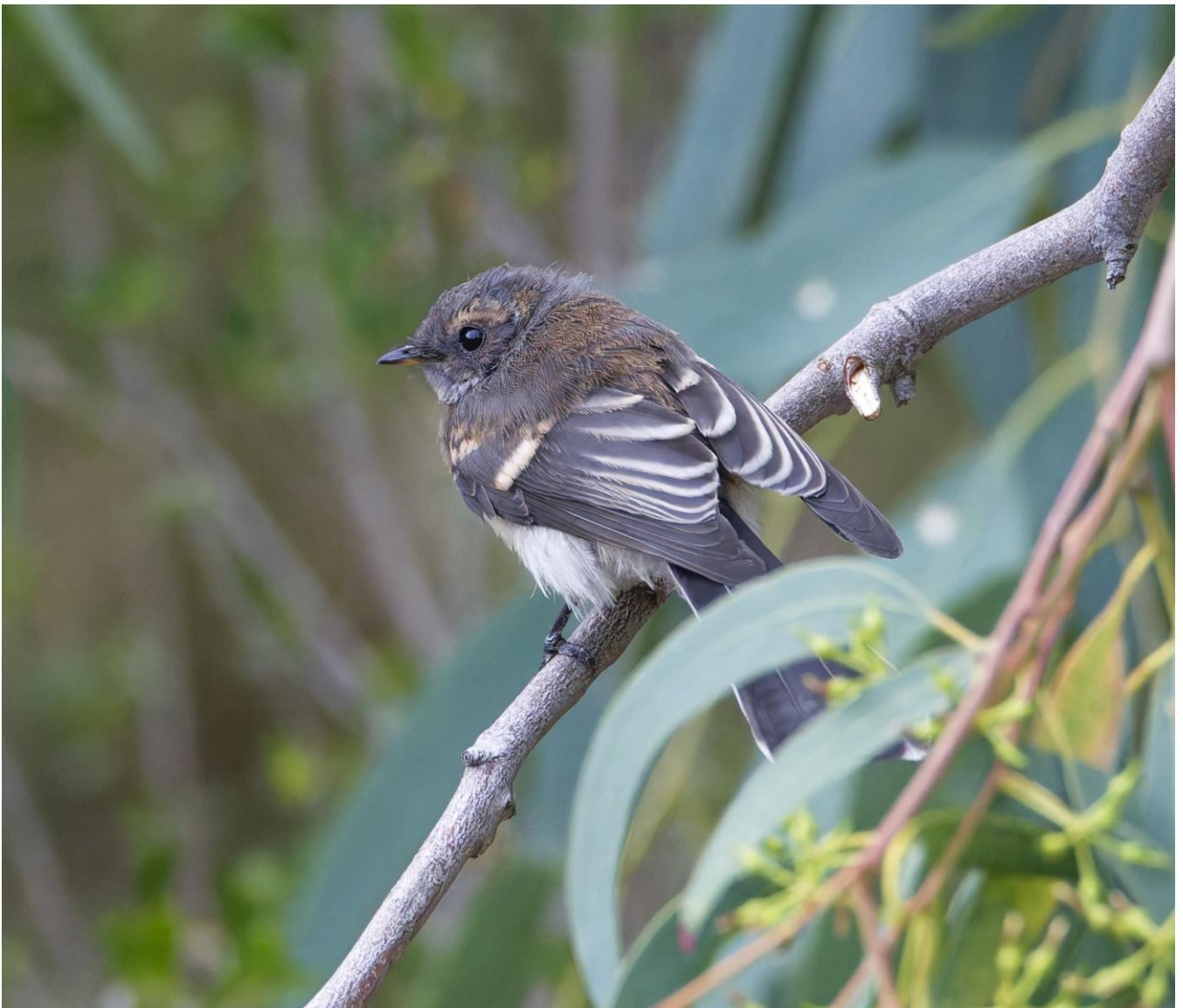
Juvenile Grey Fantail in the park today