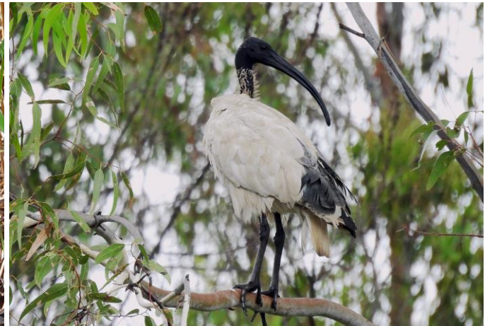
Purple Swamphen with chick and Australian White Ibis