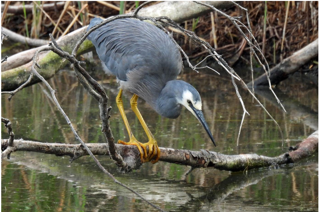
White-faced Heron about to capture a meal, no doubt a Gambusia fish.