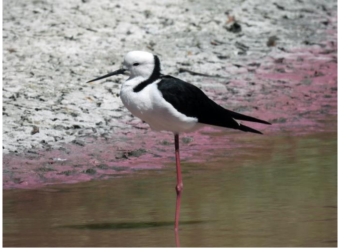
Pied Stilt chicks upper left and adult all standing on one leg on the pink edge of the saltwater lake