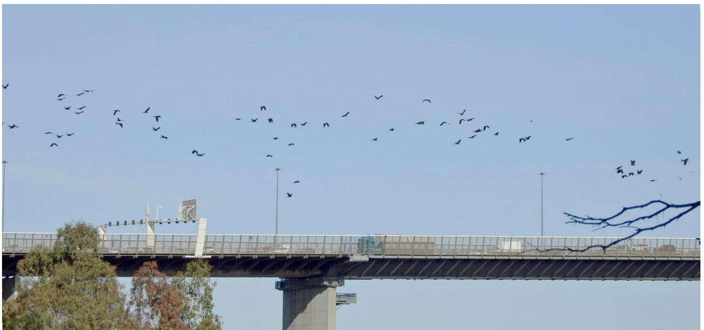
Over sixty Yellow-tailed Black Cockatoos flew over the park today. Some came down to feed in the wattles by chewing away the wood to feed on beetle larvae. Also, about 35 were in the park on 18 August