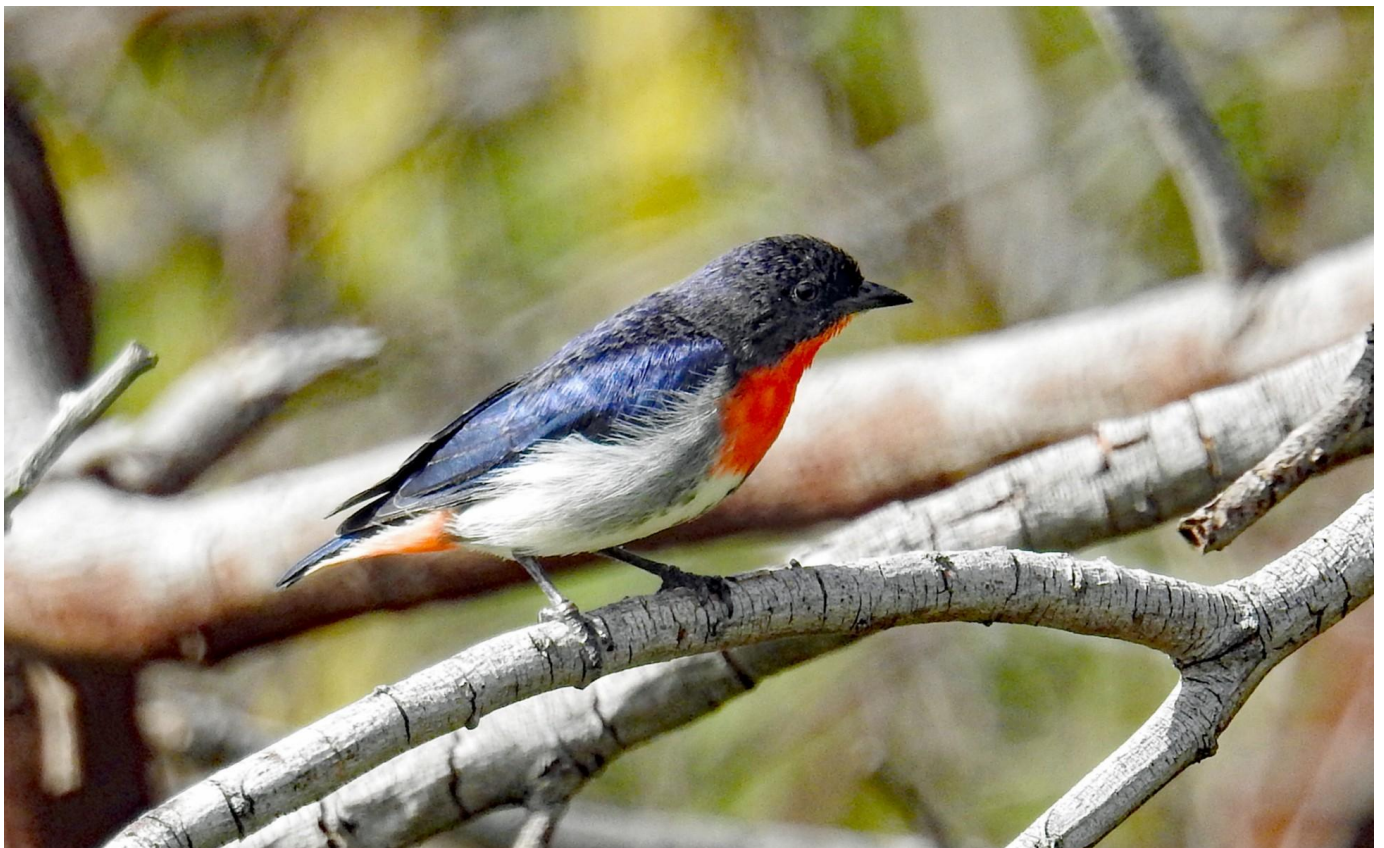
The Mistletoebird seen during the survey today, the first recorded sighting of this species for Westgate Park. One was heard but not seen during the May survey.