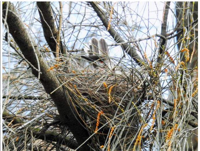
Red Wattlebird collecting nesting material on 20/8 and nest 22/8