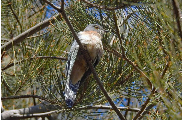
A Fan-tailed Cuckoo that briefly visited the park on 20 August