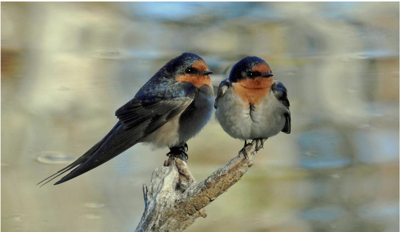
Roosting Welcome Swallows. Note the dark breast colour on the bird to the left. Could it be another species or result of hybridization?