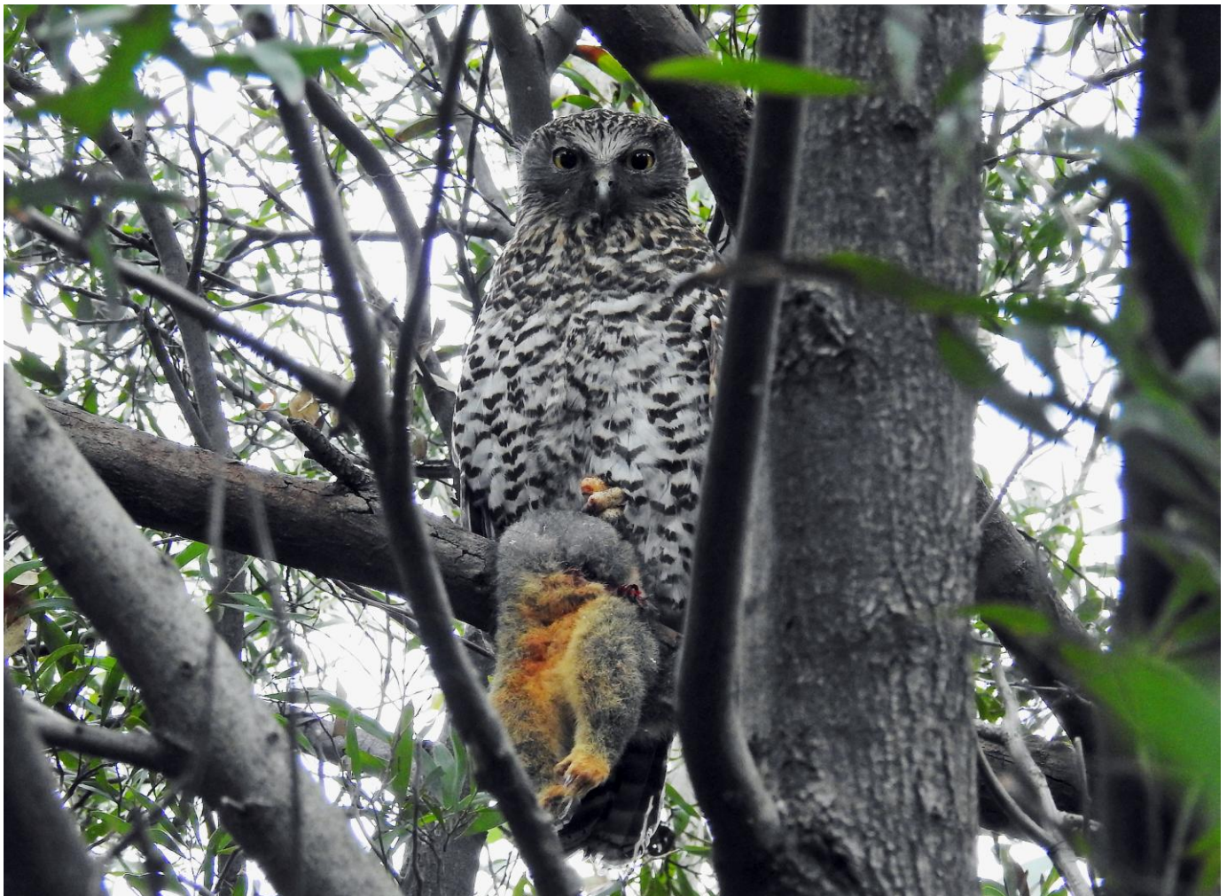
The Powerful Owl with a Brush-tailed Possum on 18 August. Although not seen today it may still be present somewhere in the park as fresh evidence was found on 27 August, but with no confirmed sighting