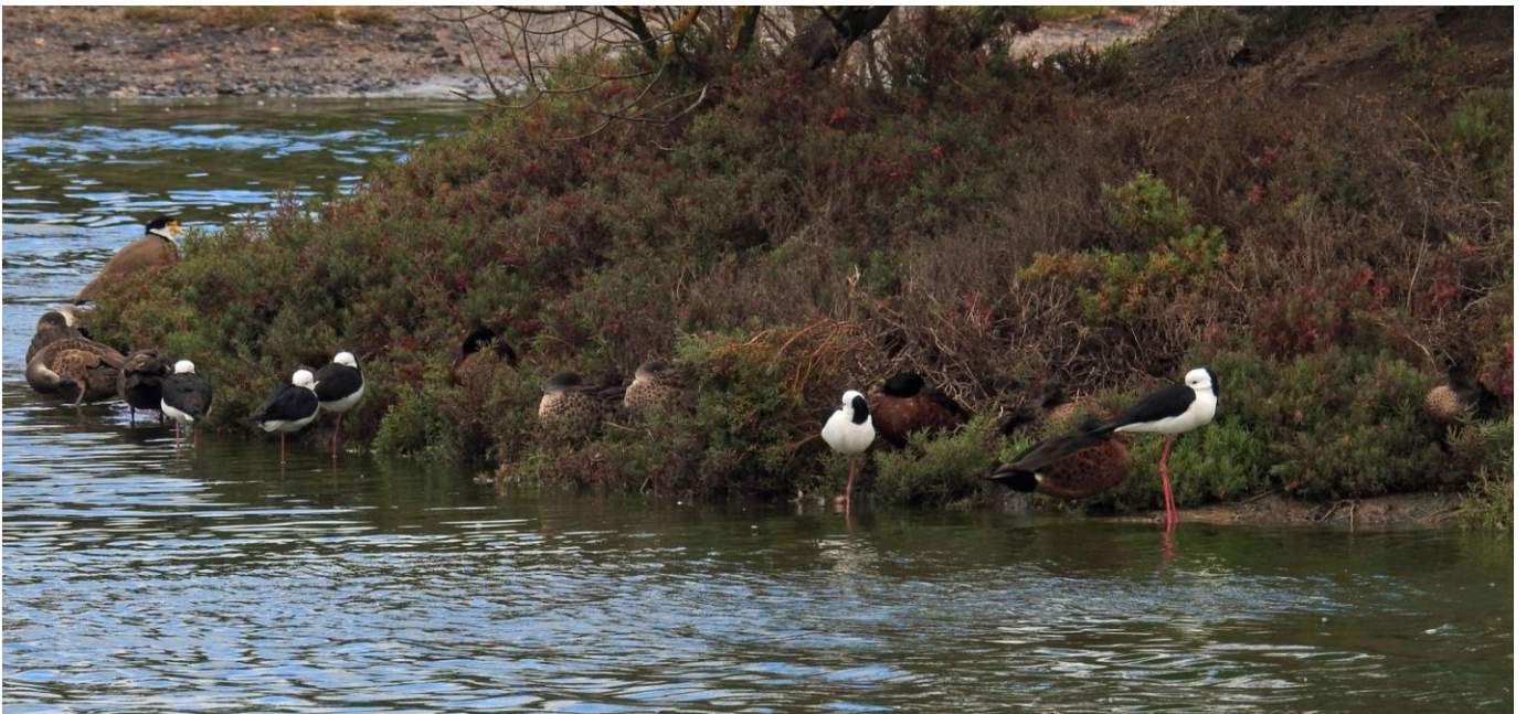
Five Pied Stilts on the edge of the Salt water lake