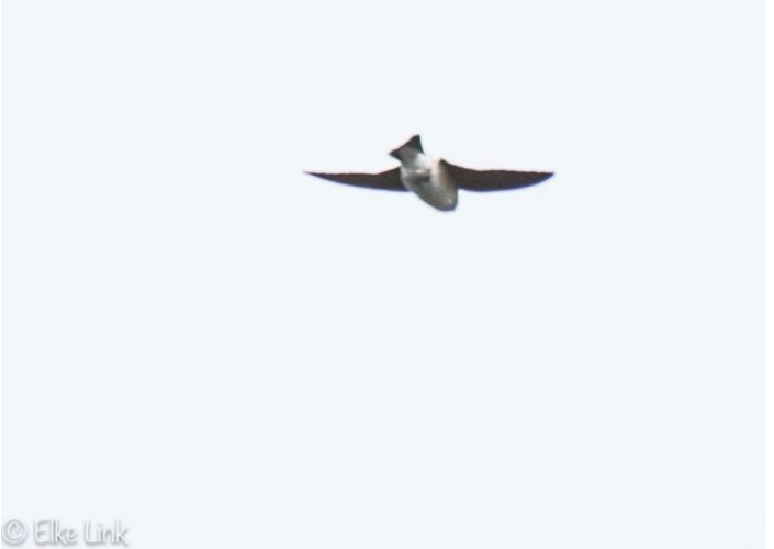
One of two Fairy Martins seen today