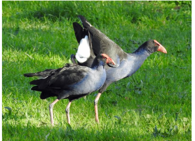
Mating behavior indicates that the Purple Swampheens are almost ready to breed