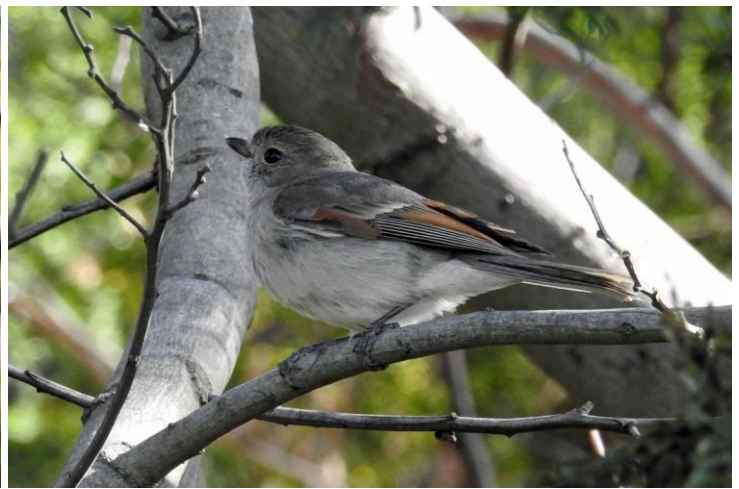
Golden Whistlers, an immature male photographed on 22/8 right and juvenile photographed on 27/8 left