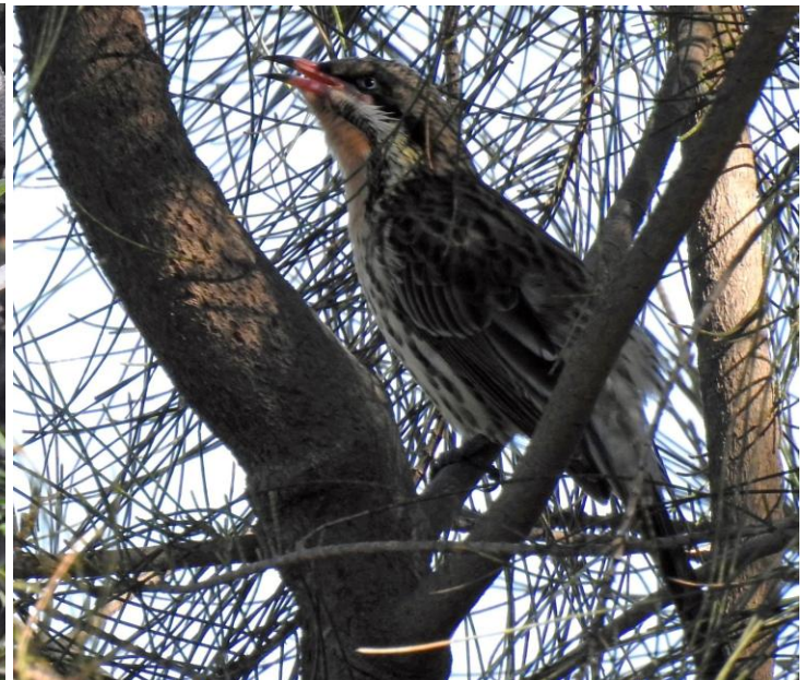
Left a Little Wattlebird in one of its favorite trees, a Coast Banksia, and right Spiny-cheeked Honeyeater a winter visitor taken on 15 May