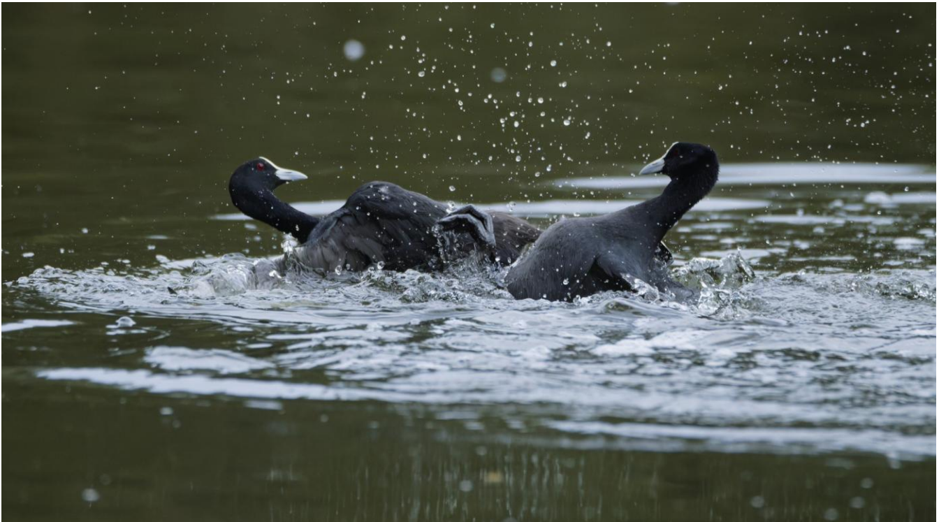
Brawling coots in a two against one fight on the freshwater lake