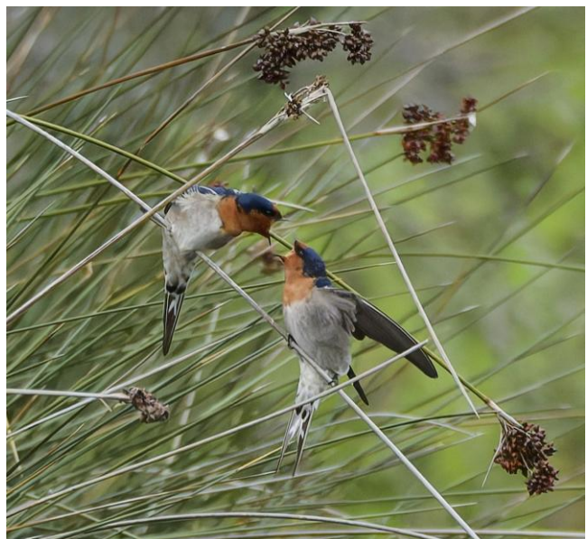
A not so welcoming Welcome Swallow on sharing its perch