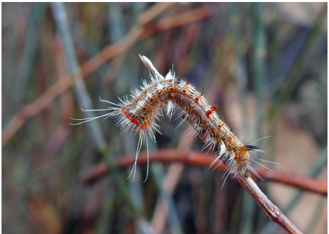
She-Oak Moth Pernattia pusilla

Images on this page by Ursula Dutkiewicz