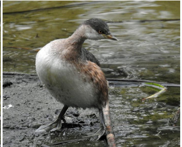
Hoary-headed Grebe emerging out of the water – they do not do this very often