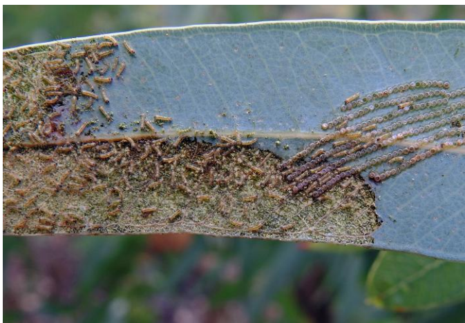
Gum Leaf Skeletoniser Uraba lugens