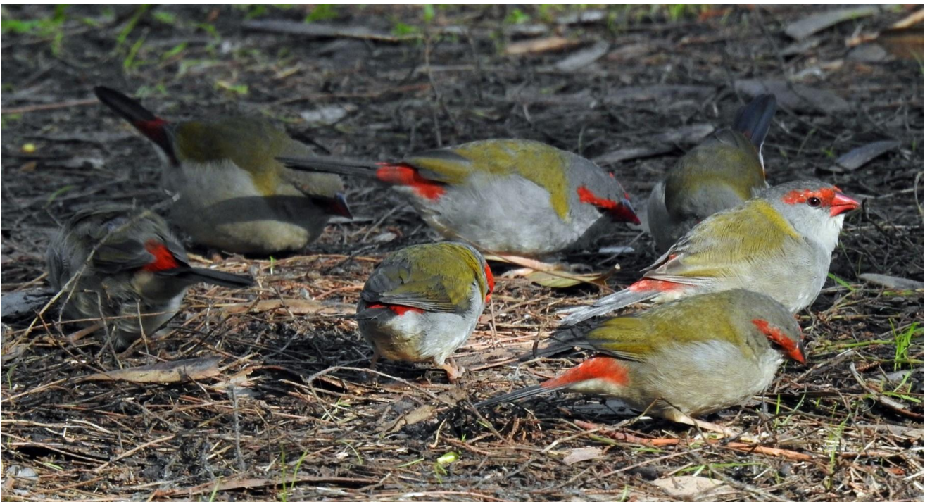
Group of ten Red-browed Finches, including at least two immature birds