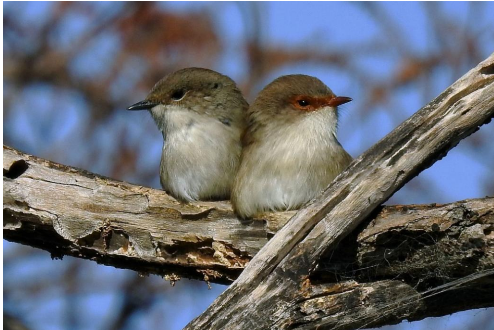
Pair of Superb Fairy-wrens snuggling together, male left and female right