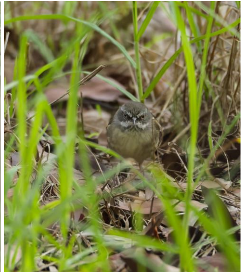
One of 11 White-browed Scrubwrens seen today