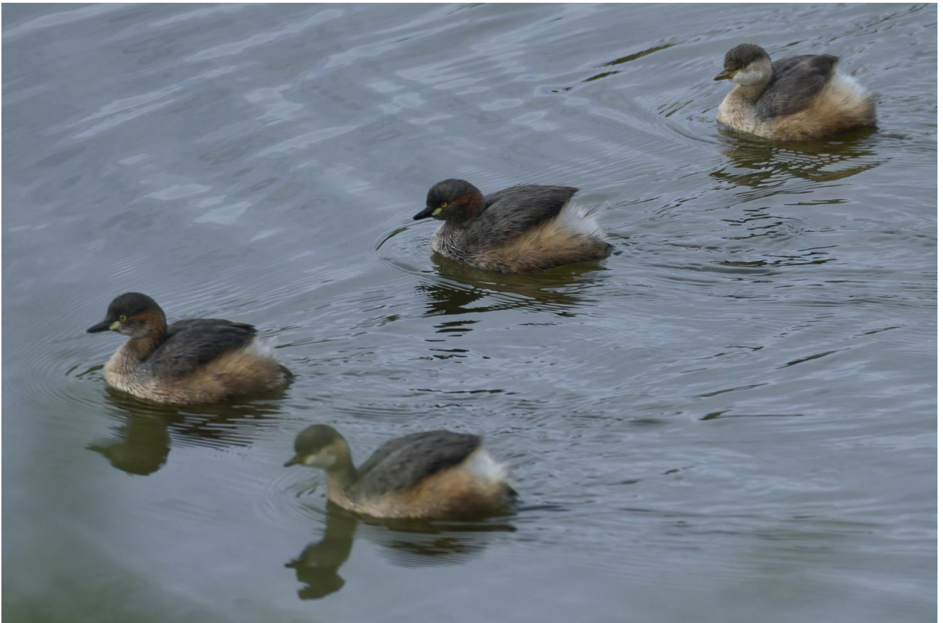
The four Australasian Grebes seen today