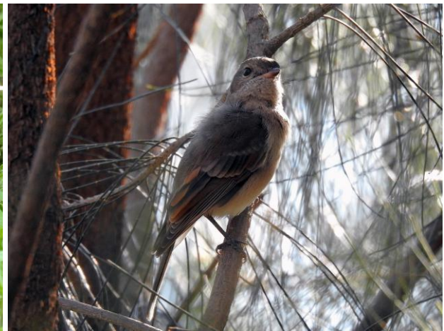
White-plumed Honeyeater swallowing a saltbush berry, and immature Golden Wistler on 29 May