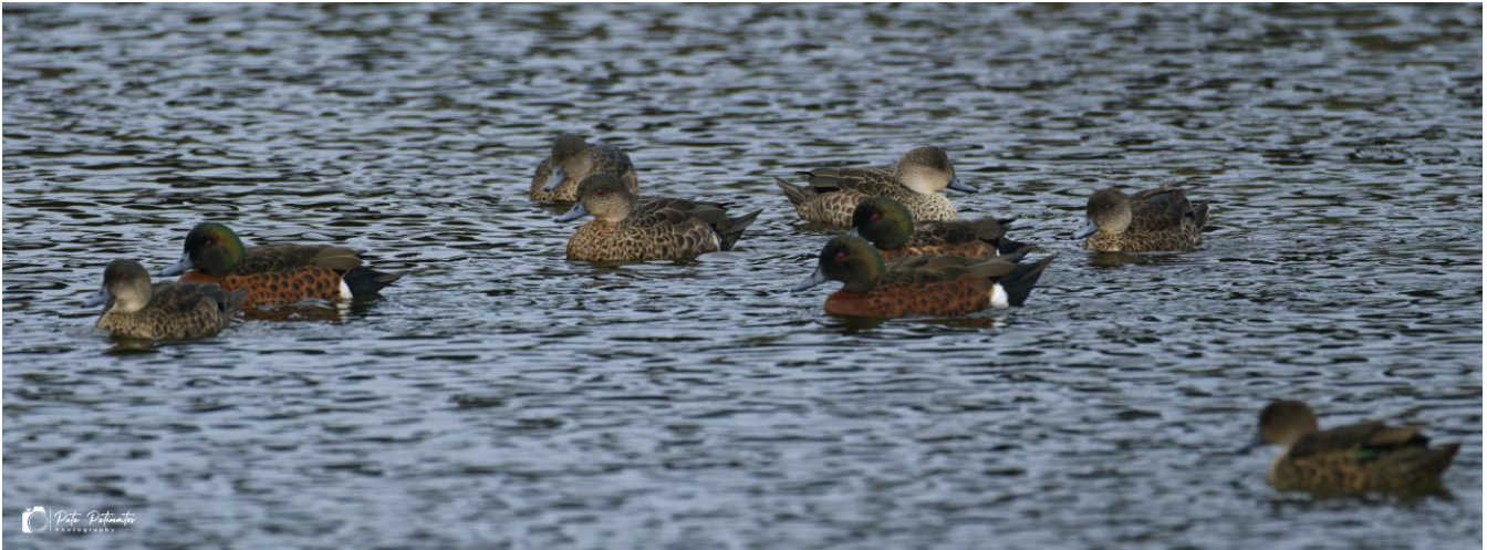
Chestnut Teal have doubled their numbers in the park compared to recent months