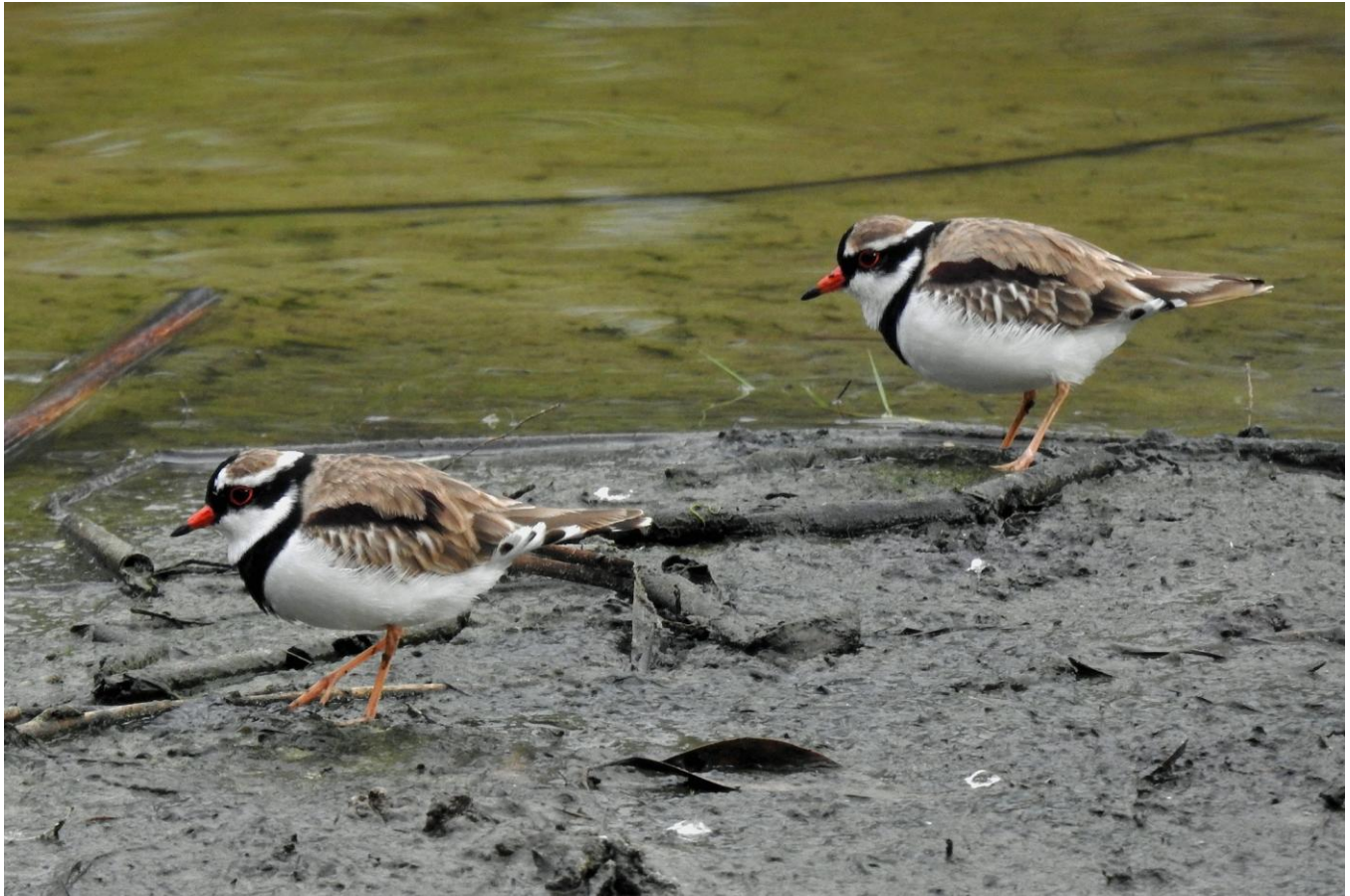
Pair of Black-fronted Dotterel taken on 25 May - most likely the same pair seen today