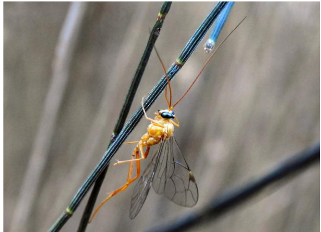
Ichneumonid Wasp – Subfamily Ophioninae