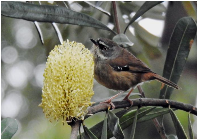
White-browed Scrubwren in Coast Banksia