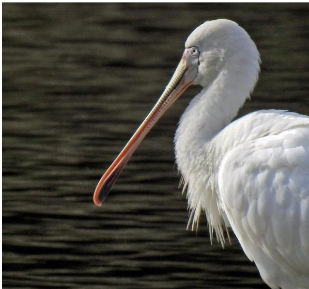
Yellow-billed Spoonbill in the park on 8 May