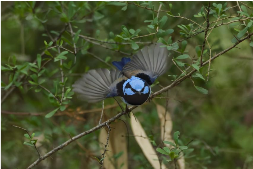
Only 3 of 31 Superb Fairy-wrens were in blue plumage today