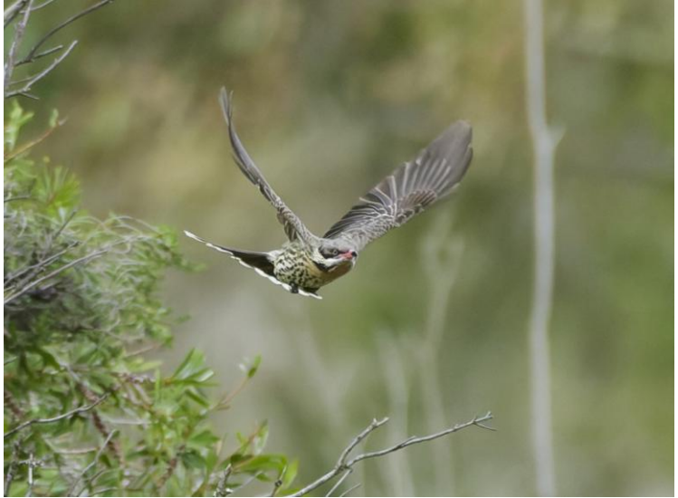
One of two Spiny-cheeked Honeyeaters seen today