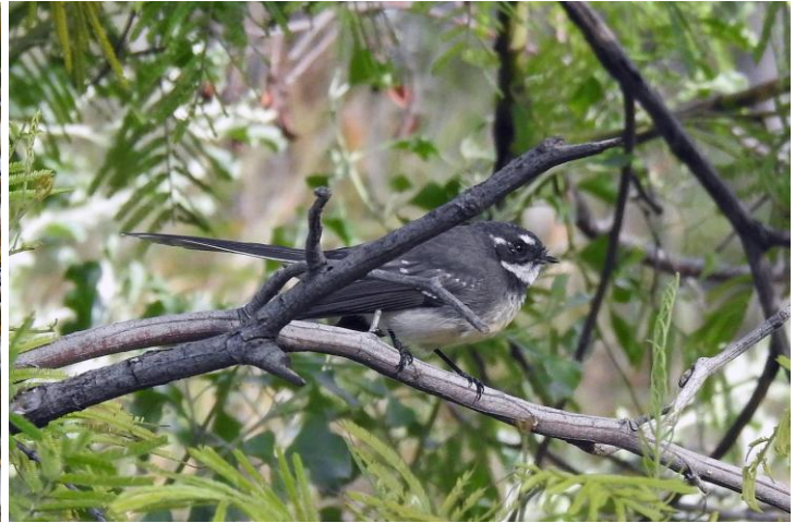
Brown Thornbill taken on 6 May, and the only Grey Fantail seen over the last few weeks on 20 May